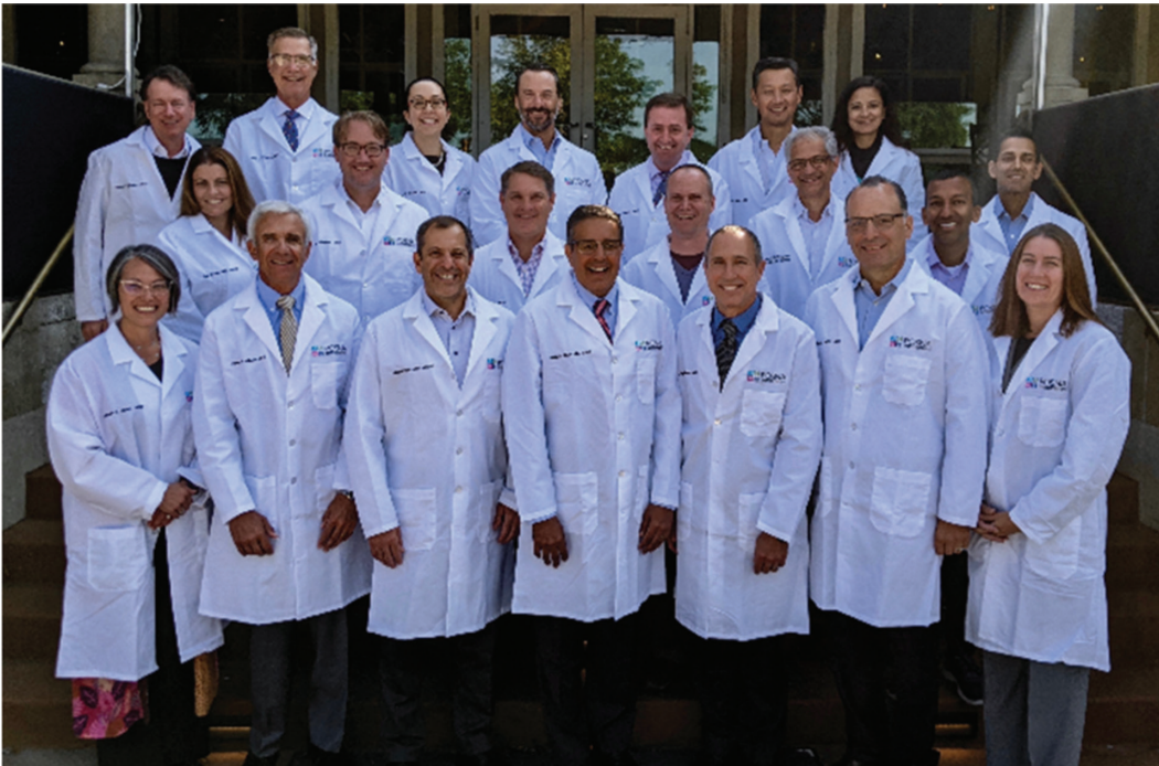
Figure 1. The POSNA board at their September 2021 meeting.

poor outcomes from infection, antisepsis, and lack of blood control. It's why the barber shop pole has white, red, and blue. White is for gauze bandages, red is for arterial bloodletting, and blue is for venous bloodletting. So, for me, the white coats were to remind us that we're clinicians, and our focus is really on patients. That's our vision: a world with optimal musculoskeletal health for all children. We need to keep our focus on the patients. It was to remind us that we are scientists and that we don't just jump on trends and fads. We need research, we need data, and we need to focus on quality and safety. One of my favorite things to do in the first week of August is to go to the White Coat Ceremony at Harvard Medical School and to see the students get their white coats and say the oath of Hippocrates. And I think if we remember back to our own White Coat Ceremonies, we can think of the hope and wonder that we had when we got our white coats and the privilege that we had to join this profession. I think we should remember that when we're putting on our white coats.