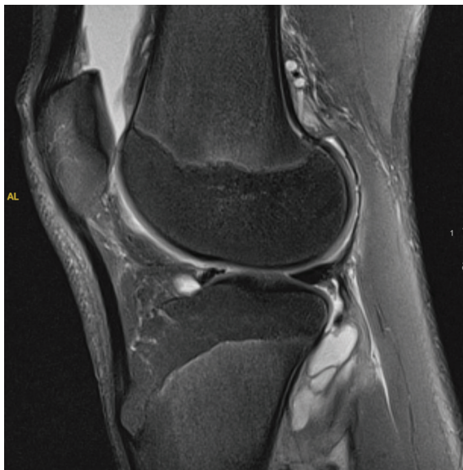
Figure 1. 15-year-old male with Lyme arthritis of left knee. Sagittal T2-weighted fat suppressed MRI revealing joint effusion, synovial thickening, and high-signal-intensity fluid within the popliteus muscle.

Results from this study showed that the presence of one or more of these factors increased the risk of septic arthritis. Results from this study showed that the risk of septic arthritis with none of these factors was 2%, (1) factor was 18%, (2) factors was 45%, (3) factors was 84%, and if all (4) factors were found, the data predicted a 100% risk of septic arthritis. On the contrary, the authors suggest that if a presenting patient is older than 2 years of age, without a history of fever or limitation of motion in the affected knee and has a CRP of less than 4 mg/L, then they may be safely observed in anticipation of Lyme serologic studies to confirm the diagnosis