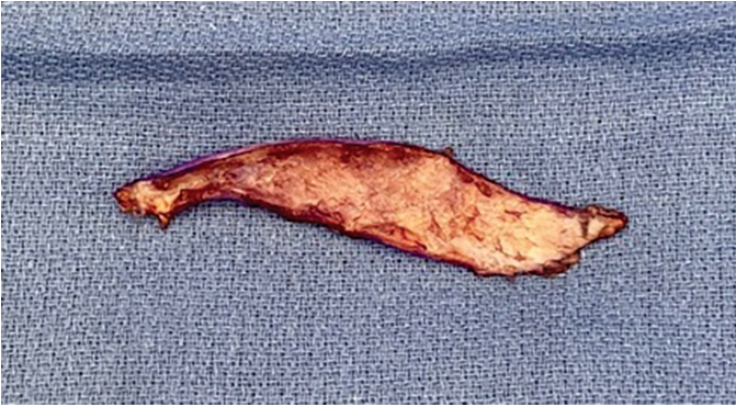
Figure 2. Full-thickness skin graft following thinning. Note the absence of subcutaneous fat from the graft and relatively uniform appearance of dermis.