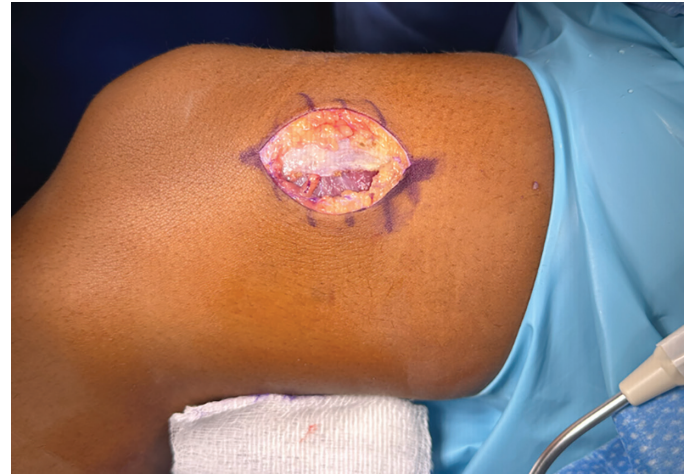
Figure 6. Skin graft donor site along medial thigh.

The skin graft was trephined to facilitate fluid drainage and secured to the recipient site. To ensure appropriate compression and minimize shearing forces, a Xeroform bolster was utilized to secure the skin graft (Figure 7).