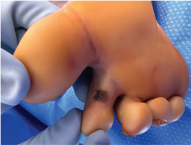
Figure 4. Suspicious appearing nevus along the plantar surface of the second toe.