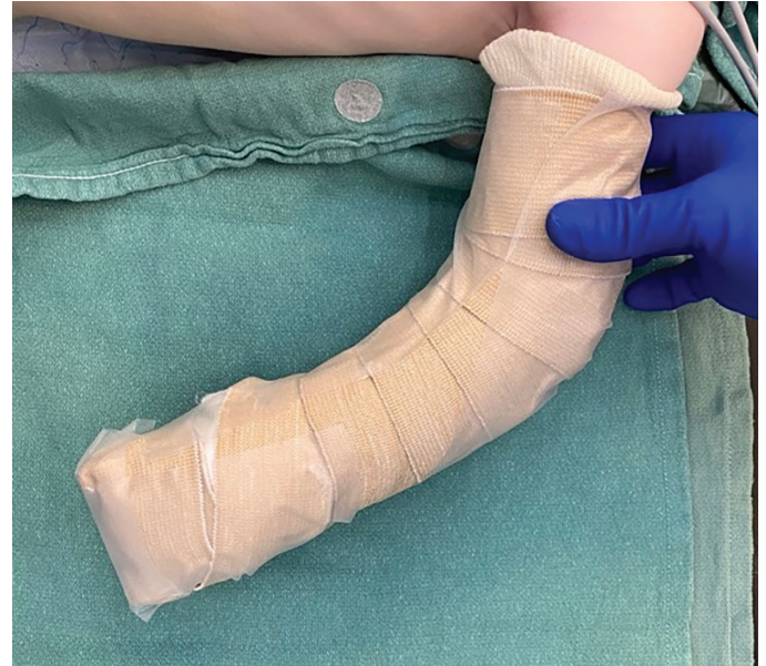
Figure 3. Well-padded splint applied to entire upper extremity to allow for maximal skin graft take.