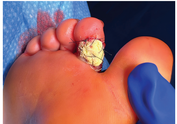
Figure 7. Xeroform bolster secured with interrupted Nylon sutures.

A 2-week postoperative follow-up revealed excellent skin graft take (Figure 8).