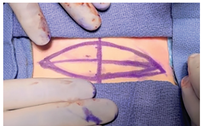
Figure 1. Intraoperative photograph of skin graft markings. Vertically oriented line is determined according to the patient's midline.