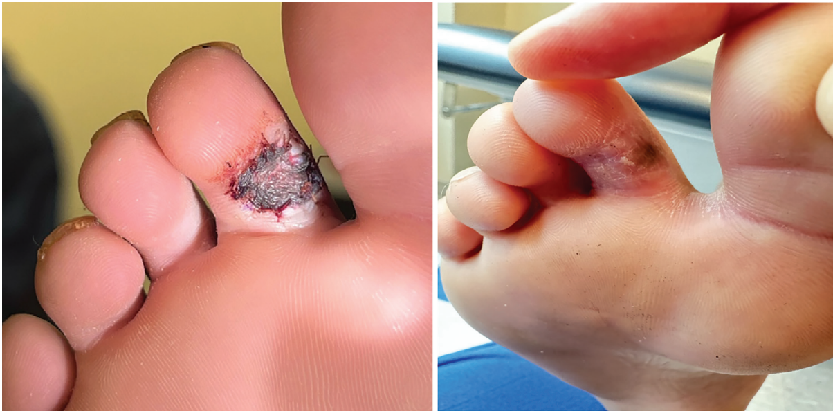
Figure 8. Appearance of skin graft at 2 weeks (left) and at 6 weeks final follow-up (right).

to increased dependence on pain medications and the demand for more caretaker or nursing attention.