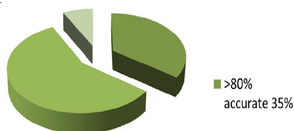
Figure 2: % accuracy of consent forms with all complications

Conclusion: We concluded that in our standard consent forms documenting complications varies from the person-person and often few complications are missed leading to problems later on. Hence patient safety and quality assurance are compromised. Also, legal issues can arise affecting the surgeon.