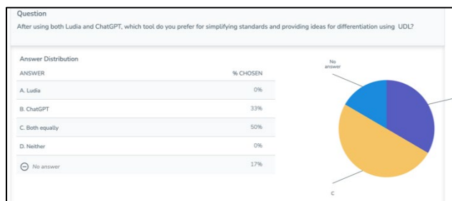
Figure 3. Preservice teachers preferred AI tool.

standards and provide differentiation ideas using UDL? (Differentiation and UDL Nearpod Presentation [PDF], slides 34-35). Figure 3 reveals that 50% of students stated both, 33% of students stated ChatGPT, and 17 % did not respond.