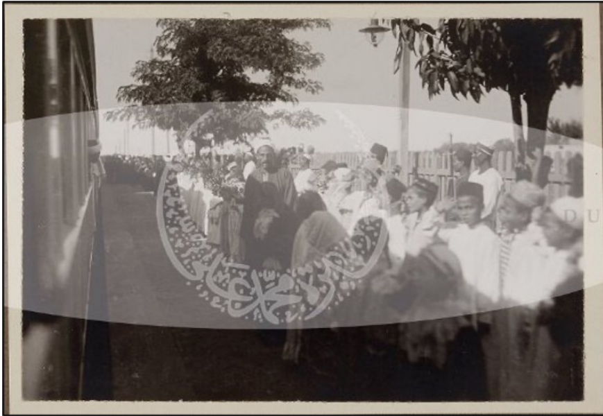
Figure 3: Khedive 'Abbas Hilmi II attending events at Alexandria, 1910s.

This approach to students' performances was not confined to Egyptian authorities. While the specific reasons for organizing official school visits and showing off academic excellence varied based on the priorities of different authorities—such as the securing of funds for the school by means of inviting prominent local and foreign personalities—the underlying interest in children and students as a source of pride for society and the nation was a remarkably common factor across local and foreign communities. Moreover, the use of school examinations, prize ceremonies, and recitals to promote political interests was by no means limited to Egypt in this period. 54