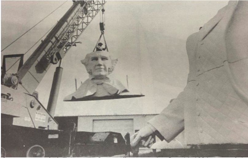
Construction of “A Tribute to Courage,” seen in the Oct. 16, 1994, issue of the Huntsville Item