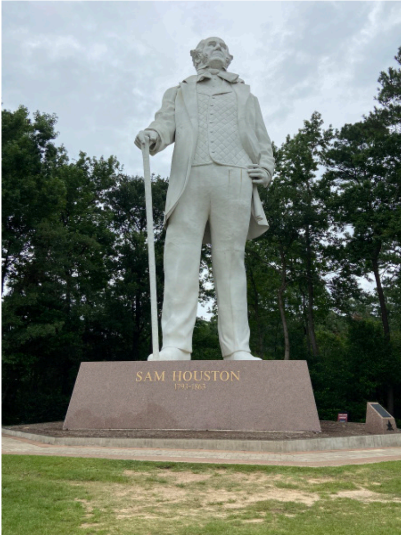
"A Tribute to Courage," 2024