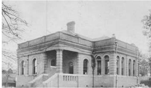
Fig. 1: Peabody Library, 1903

approximately 190,000 volumes in the building (Estill 72). Consequently, a third library was built in 1968 and later named after Newton Gresham, a member of the prestigious Board of Regents, in 1985 (“About the Newton Gresham Library”).