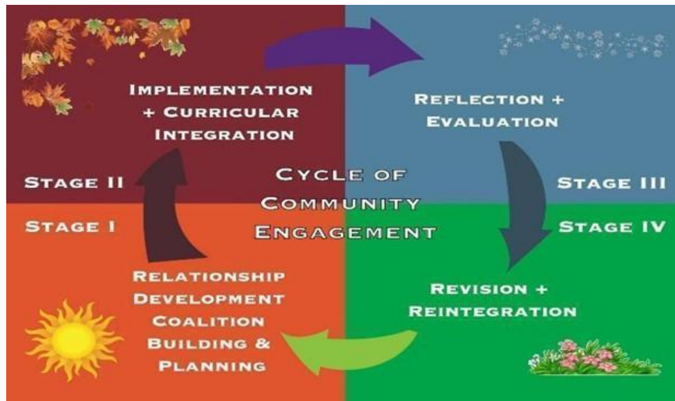
FIGURE 1. Building bridges and the cycle of engagement.