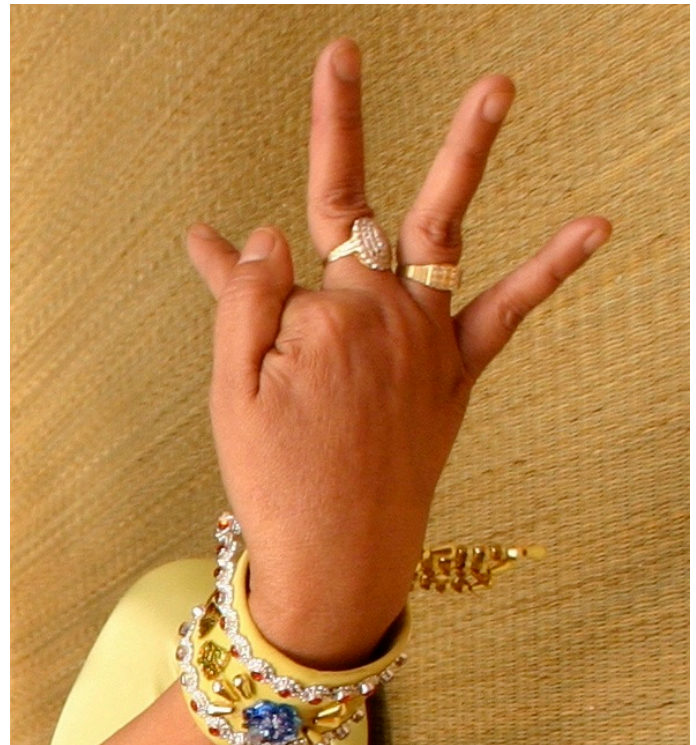
Figure 2: A detail of the right hand of Fatimah binti Abdullah in the position of titik bermula , the point of beginning, a movement often understood to be an embodied representation of the word Allah written in Arabic script. Photo: Patricia Hardwick, 2004.

even an embodied response to an internal wind felt rising within a performer during performance that causes their hands to flutter involuntarily, much in the way that wind rustles the leaves of a tree.