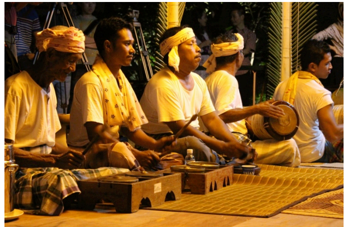
Figure 6: View one of a traditional mak yong orchestra. Instruments pictured from left to right: canang-kesi , gendang anak , gendang ibu .