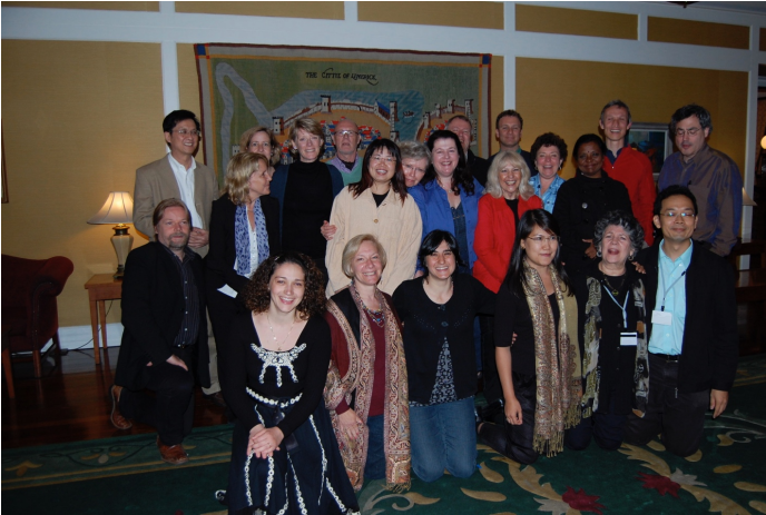
Figure 5. IAMM Founding Members at the Inaugural Ireland Conference in 2009.