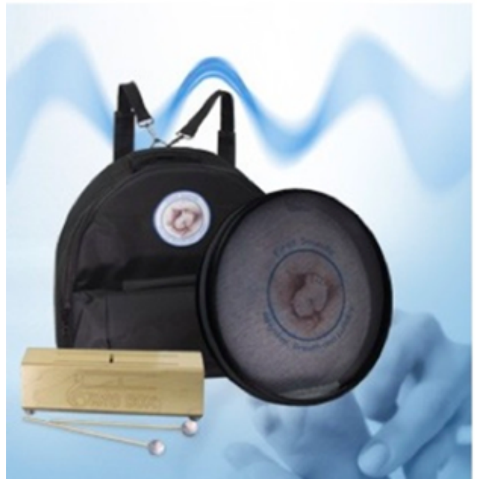
Figure 4. Remo Gato Box and Lullaby Ocean Disc.

the Ocean Disc™, is meant to replicate the whoosh of the womb. (Figure 4). Rotating it simulates the variable rhythms present in the womb. This has become a popular tool used by music therapists to interact and entrain with NICU babies [21].