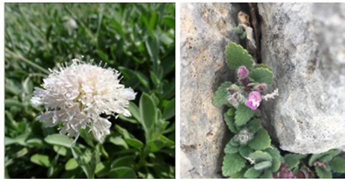
Figure 1. Mature individuals of Lomelosia minoana subsp. minoana (left) and Scutellaria hirta (right) in their wild habitats at mountain areas on the island of Crete, Greece

The living plants collected from the wild (Table 1; Figure 1) in Crete were transplanted and maintained in a greenhouse.