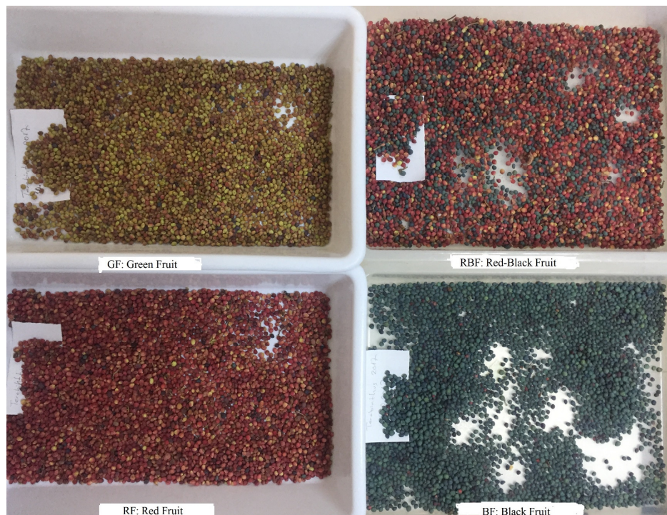
Figure 1. Green (GF), Red (RF), Red-Black (RBF) and Black turpentine fruits

following conditions. A TG-Wax MS, 5% Phenyl Polysilphenylene-silohexane column with a 0.25 mm internal diameter x 60 m length, 0.25 \mu\text{m} film thickness has been used. Carrier gas used in the study was helium (99,9%) with a flow rate of 1 mL \text{m}^{-1} . Ionization energy has been set as 70 eV and mass interval has been set as m/z^{-1} 1,2-1200 amu. Scan mode has been used for data collection. MS transfer line temperature was 250 ^{\circ}\text{C} , MS ionization temperature was 220 ^{\circ}\text{C} , injection port temperature was 220 ^{\circ}\text{C} , and column temperature was 50 ^{\circ}\text{C} at the beginning and then raised up to 220 ^{\circ}\text{C} with a temperature increase rate of 3 ^{\circ}\text{C} \text{m}^{-1} . The structure of each compound has been identified with Xcalibur program, by using mass spectrums (Wiley 9).