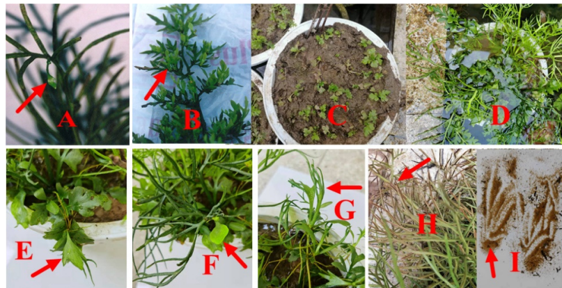
Figure 4. Vegetative growth of some natural and ex situ conservation populations of C. thalictroides in China (indicated by arrows). A-B: Vegetative growth of some natural populations (A: Sterile fronds gave rise to ramets; B: Fertile fronds gave rise to ramets); C-I: Vegetative growth of the ex situ conservation populations (C: The plants collected from the natural populations were transplanted into flowerpots; D: The habitat where vegetative growth of C. thalictroides was observed; E: Sterile fronds gave rise to ramets; F: Fertile fronds gave rise to ramets; G: Numerous marginal leaf buds of sterile fronds develop into many sporophytes containing fertile fronds; H: Mature sporophytes; I: Spores)

Two types of vegetative reproduction were observed in some of the natural populations and ex situ conservation populations of C. thalictroides in China (Figure 4). Vegetative growth originated from either sterile or fertile fronds, giving rise to ramets (Figure 4). Of the 21 extant populations found in the field survey in 2021, only the population at Xishuangbanna in Yunnan Province showed vegetative growth. The 21 extant populations are located in Zhejiang, Jiangxi, Fujian, Jiangsu, Shanghai, Yunnan, Anhui, Henan and Guangxi provinces, China. Among ten ex situ conservation populations in Wuhan, China, only the population from Yihuang, Jiangxi Province showed clonal growth. The phenomenon in which numerous marginal leaf buds of sterile fronds develop into many sporophytes containing fertile fronds was also observed in September 2021, and mature spores were collected (Figure 4).