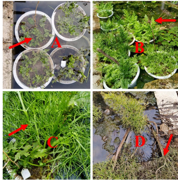
Figure 5. Main periods of ex situ conservation of C. thalictroides at Jiangnan University in Wuhan. A: The plants from the natural populations collected in the field were transplanted into flowerpots and artificial pools; B: The period of sterile leaf growth; C: The period of fertile frond growth; D: The period of mature sporophytes and spores.

In Wuhan, China, ten populations from Zhejiang, Jiangsu and Fujian provinces have been established with ex situ conservation (Figure 5). The survival rate of plants is more than 90%, and mature sporophytes and spores were collected.