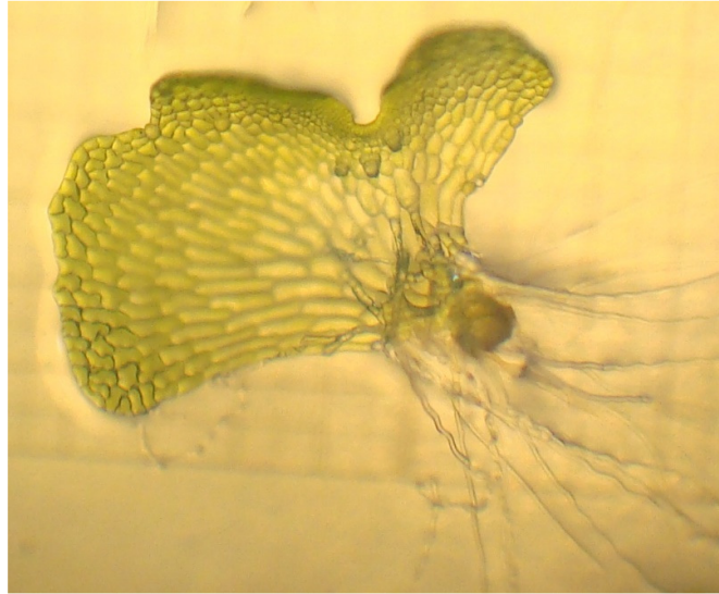
Figure 3. Photograph of gametophytes of C. thalictroides under a digital microscope ( \times 40 )

Two types of vegetative reproduction were observed in some of the natural populations and ex situ conservation populations of C. thalictroides in China (Figure 4). Vegetative growth originated from either sterile or fertile fronds, giving rise to ramets (Figure 4). Of the 21 extant populations found in the field survey in 2021, only the population at Xishuangbanna in Yunnan Province showed vegetative growth. The 21 extant populations are located in Zhejiang, Jiangxi, Fujian, Jiangsu, Shanghai, Yunnan, Anhui, Henan and Guangxi provinces, China. Among ten ex situ conservation populations in Wuhan, China, only the population from Yihuang, Jiangxi Province showed clonal growth. The phenomenon in which numerous marginal leaf buds of sterile fronds develop into many sporophytes containing fertile fronds was also observed in September 2021, and mature spores were collected (Figure 4).