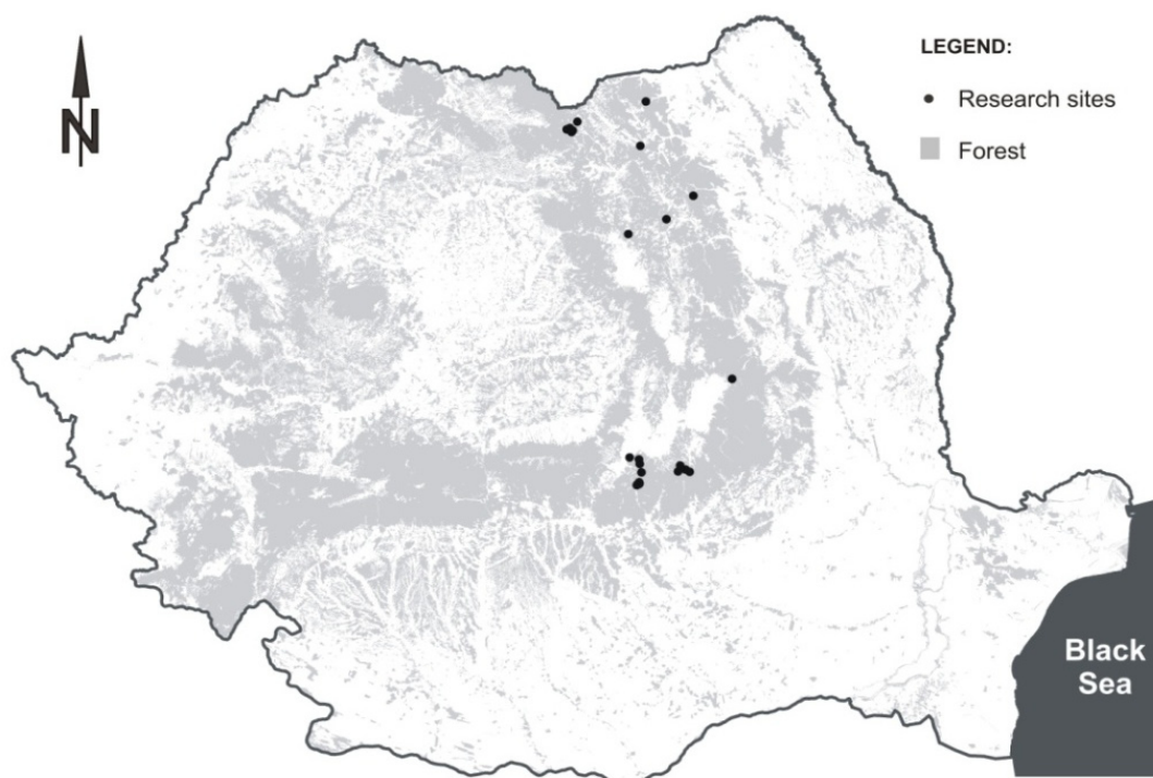
Fig. 1. Location of the research sites

The measurements were conducted in 25 Norway spruce plantations established on non-forest lands. These plantations are located in the Eastern Carpathians of Romania (Fig. 1), where the largest range of this tree species at country level occurs (Şofletea et al. , 2008). This part of Carpathians covers almost the entire latitude range of the species at national scale. The altitude of the sites ranged between 641 and 1563 m and the age of these 25 plantations ranged between 1 and 12 years. Ten sample trees from each plantation were selected for measurements.