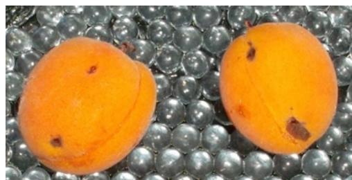
Fig. 3. Artificial infection with Erwinia amylovora on apricot fruits

The API 20E test is used for the determination of the species belonging to the Enterobacteriaceae family. The collected isolates were tested with API 20E kits in order to identify them as E. amylovora . The isolates showed positive reaction for \beta -galactosidase and citrate utilization, acetoin production and also in glucose, mannitol, sorbitol, saccharose, melibiose and arabinose reactions. The results were negative in case of arginin-dihydrolase, lysine decarboxylase, ornithine decarboxylase, H_2S production, urease, tryptophan deaminase, indole production, gelatinase, inositol, rhamnose, amygdalin tests. The biochemical properties of the tested isolate matched the description of Erwinia amylovora given in the API 20E kit.