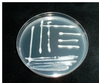
Fig. 2. Erwinia amylovora colonies on King-B agar

The bacterium colonies on King-B media were uniform, milky and cream-colored, smooth surfaced with intact outlines (Fig. 2)