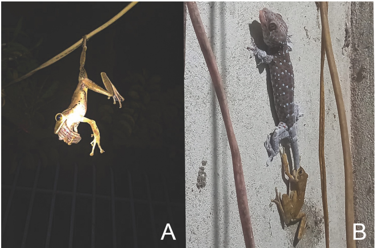
Fig. 1 – A) An adult P. megacephalus consuming on an adult Hemidactylus frenatus; B) An adult P. megacephalus trying to swallow the tail of Gekko gekko