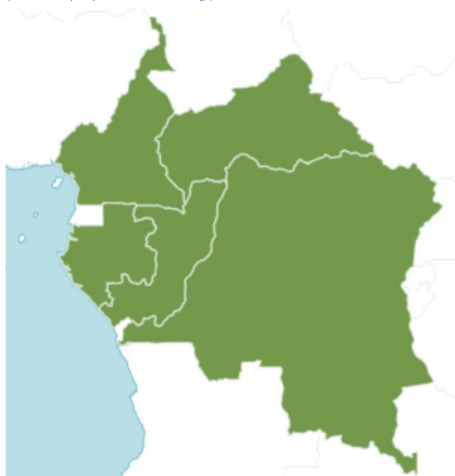
Figure 1: Geographical distribution of Ganophyllum giganteum (A. Chev.) Hauman

The plant species for this study was selected based on prior ethnobotanical surveys. The stem bark of Ganophyllum giganteum (A. Chev.) Hauman was collected from Yakoma in the Nord-Ubangi Province of the Democratic Republic of the Congo (DRC), located at approximately 22° 35' and 23° 37' longitude East, latitude 3° 48' and 4° 6' North, and an altitude of 470 m above sea level (Ngunde-te-Ngunde et al., 2020). The species was identified (No. 2127) at the Institut National d'Études et de Recherche Agronomique, Faculty of Science and Technology, University of Kinshasa. Subsequently, the stem bark was air-dried at room temperature (approximately 27 °C) for two weeks in the Laboratory of Ethnobiology and Medical Phytochemistry and then finely powdered for further analyses.