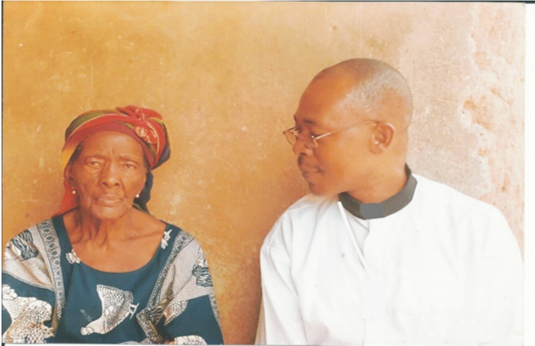
Figure 4: Researcher interviewing chief priestess of Alu, Yagba East LGA, Kogi state

There are different types of ifa, (Adewuyi 2018, Epaga and Neimark 1995, Karade 1994). The Yoruba enunciate various types of ifa based on the processes of divination (Fatimayin; personal communication). All forms of ifa perform the same roles but they are characterised by different paraphernalia and methodology of divining which brings clear differences between them. There are ifa agere (ifa on bowl), ifa iroke (ifa with tapper), ifa ikin (ifa with palm nuts), opele (ifa with chain), iyerosun (ifa with powder), ifa opon (ifa with tray) and ifa obi (ifa with kola nuts) amongst others. The researcher can conclude that ifa divinatory system is based on sorting and multiplication of binaries.