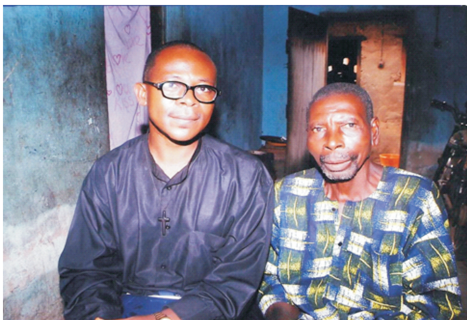
Fig 3: Researcher interviewing chief priest of Ogidi, Ijumu LGA, Kogi state.