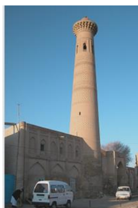
Figure 2. Minaret was damaged due to Minaret the man-made effects

Foreign guests, visitors and tourists are always impressed not only about architects' creative skills but also regarding their knowledge of mathematics, geometry. Moreover the owners of these workmanships also created a beautiful kind of art based on geometric proportions with the only mud or burnt bricks (figure 2)