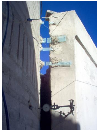
Figure 3. Deformation of (Glass indicators)