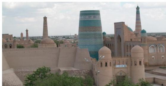
Figure 2. General view of the minarets in Ichan Kala

more than 16 minarets in Khiva, they are either big or small. A number of towers of Ichan Kala, located along the main "Khan Street", beautified ancient Khiva (figure 1)