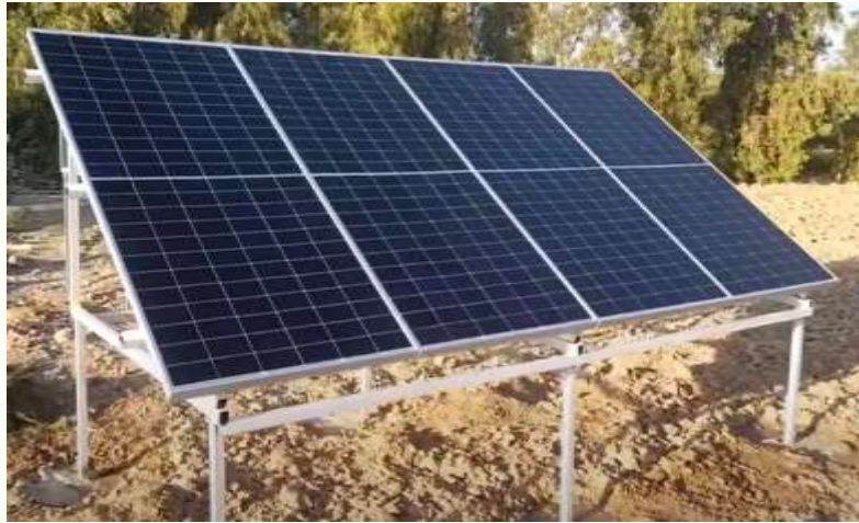
Figure 2: The solar panel