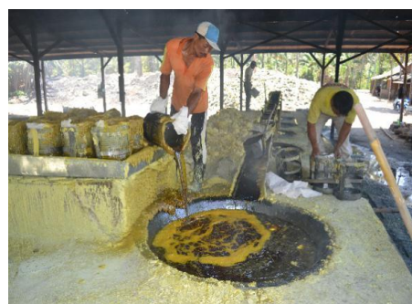
Figure 2. The miners who work in the area of sulphur burning.

The second type of the miner serves in the sulphur combustion division. The burning location is not far from CN company. The miners working in the division of combustion or processing of sulphur is not easy although the accident risk is not as high as that of the miners who work directly in the crater. Those who work in the sulphur burning division are at risk of respiratory health. All employees who work at burning division have previously been the carriers of the sulphur at least ten (10) years.