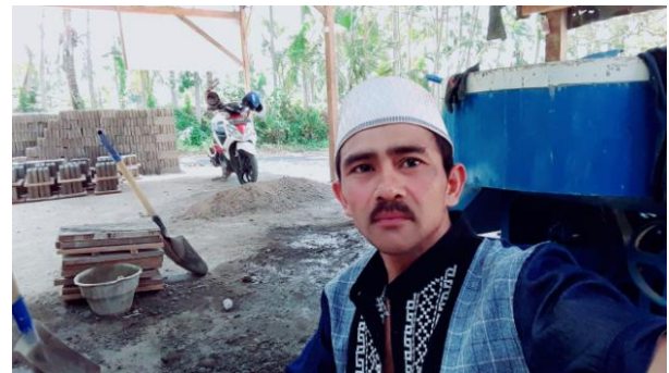
Figure 4. Miners who transform to be entrepreneurs of brick production

Meanwhile, those who run in the brick production find it successful. The brick production improves the family economy of the miners as presented in Figure 4.