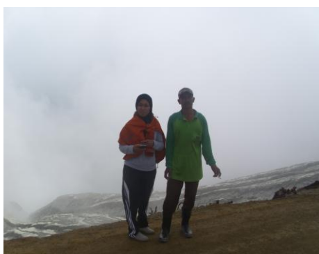
Figure. 1 The researcher with a Superintendent of Sulfatara (SS)