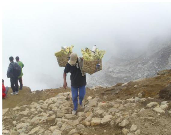
Figure 3. The miners who carry the sulphur

The three types of the miners have a severe risk to health and safety. However, the risk of unsustainable economy of the family is heavier for the sulphur carriers considering they do not have a fixed income. If the miners are experiencing health problems or are having another business, then they do not do mining, he and his family may not make income on that day. It happens also when the miners grow old that they cannot work again. Whereas, the economic sustainability of the family is very important for their childrens future [10].