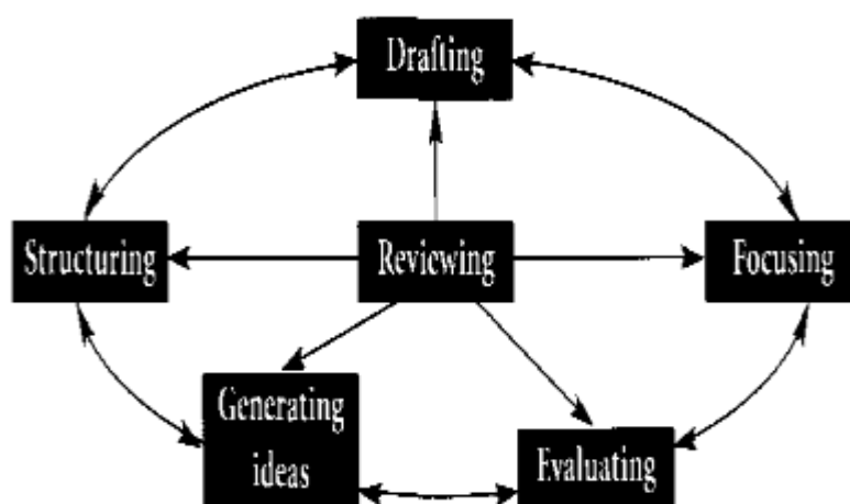
Figure 2: White and Arndts' Process Writing Model

The following diagram (figure 2) represents the model that is identified by White and Arndt to the process-based writing approach: