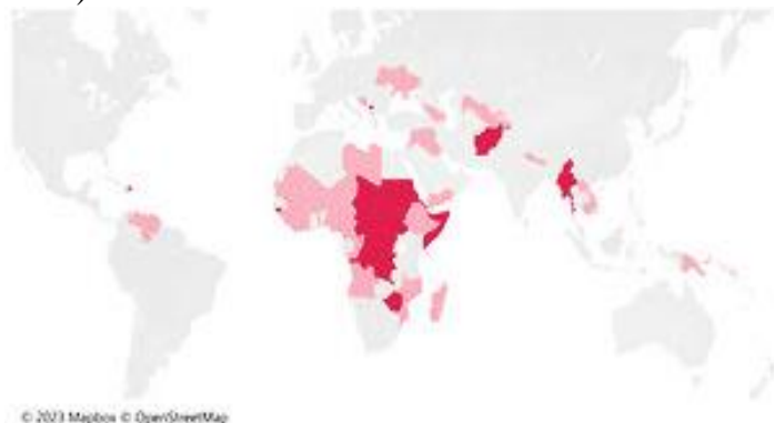
Figure 1: Fragile and Conflict Affected States, FY2006-FY2024 (source (Jaramillo et al., 2023))

It is recommended that policy makers promote integrated strategies that address various social, economic and environmental factors that define the Algerian housing market. Any way, it allows them to react on the requirements given by the fast demographic rate changes and to strive for stabilization of the housing situation for all Algerian people (Jaramillo et al., 2023) and (Dept., 2024).