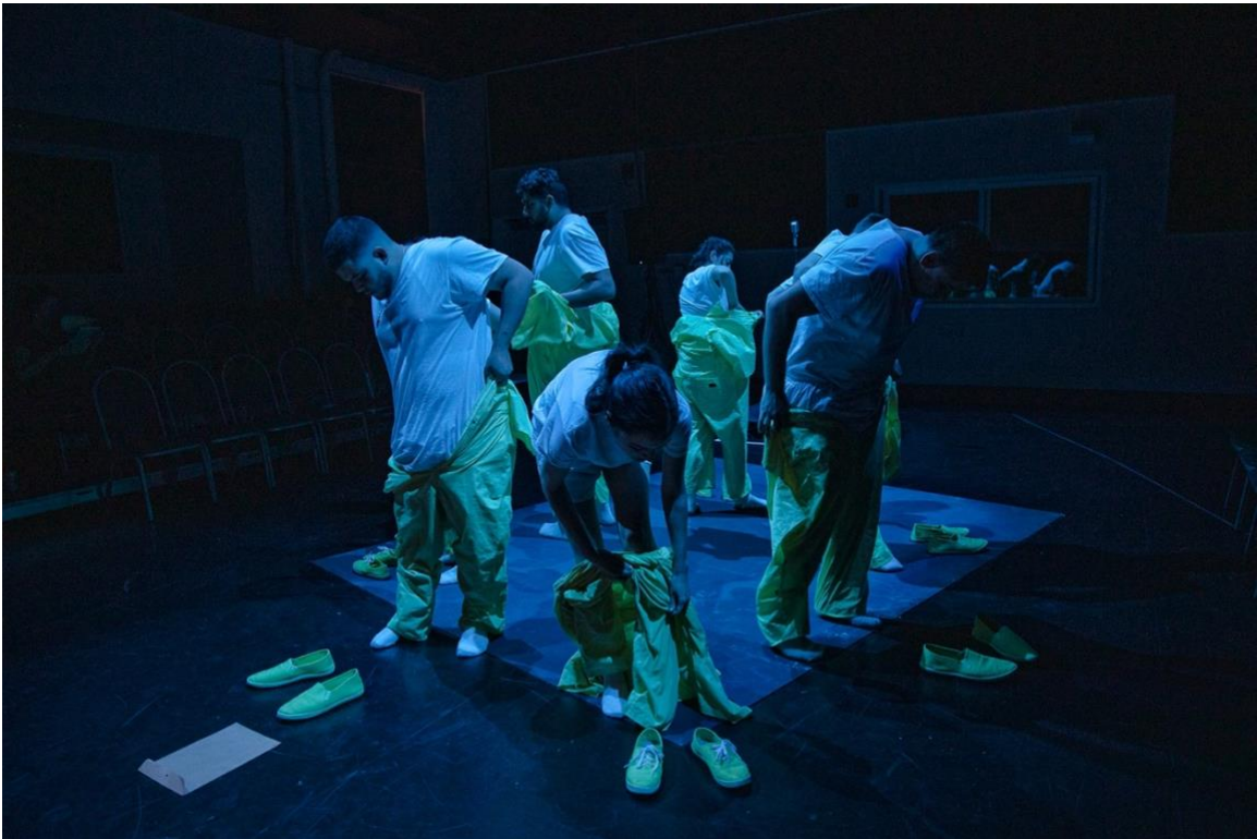
Figure 7. See You in My Dreams : Prologue