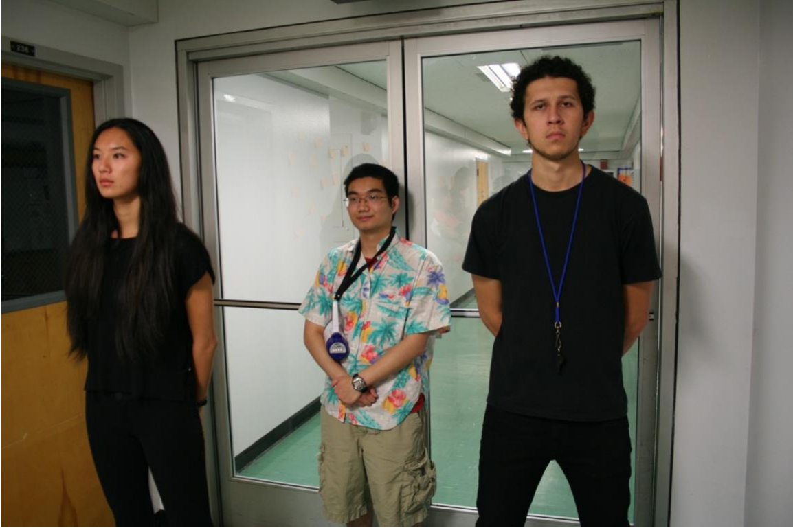
Figure 3. A Walk in Our SHUs: Guards and Tour Guide

Towards the end of the first course, I assembled an hour-long performance composed of solo and group pieces created in class. Some works were incorporated as presented, some were layered together, others were re-assigned to new performers. The performance, which the students titled A Walk in Our SHUs: An Original Performance Exploring the California Prison System , was structured in a prologue and three acts. In one classroom, audience members checked in at a table where four unsmiling Guards asked them a series of personal questions, recording the answers on forms. An ebullient Tour Guide then ushered the group into our own classroom for the first act. The second act was presented in promenade and took place down a long adjoining hallway, where small study rooms set up as cells contained solo acts performing simultaneously. A timeline outlining the history of the hunger strikes ran along with opposite wall. At one end of the hallway a room stood open as an approximation of a SHU cell; at the far end a group of students executed movement sequences against a slide show outlining the Five Core Demands made by the hunger strikers. The Guards paced the hallway, speaking only to remind audience members to look but not step into the study rooms. After roughly