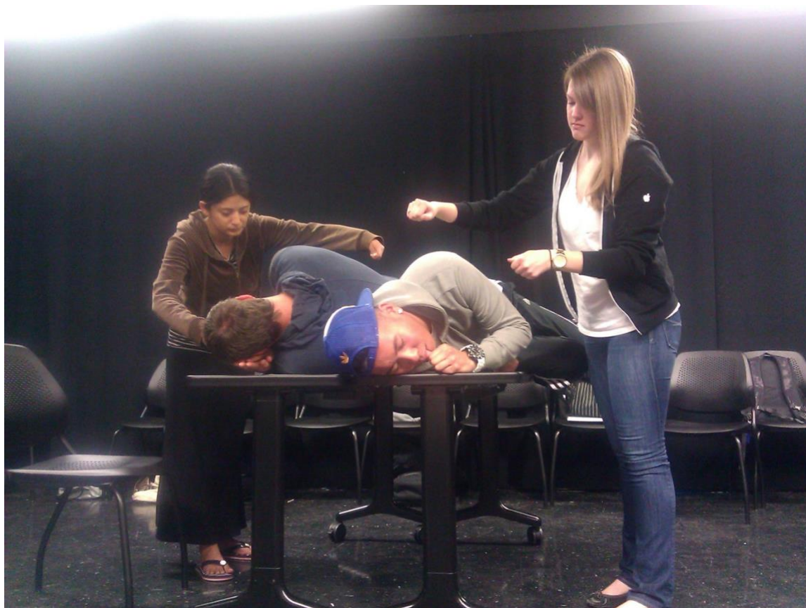
Figure 2. A Walk in Our SHUs : Rehearsal Tableau

disagreed on the length of time it took to hold the position, and as a result ended up posing during different intervals which didn't convey the message properly. 20