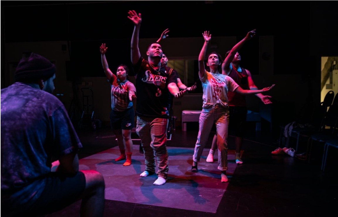
Figure 1. Dance rehearsal for See You in My Dreams .

In addition to articulating the value of embodied and experiential learning, students also seemed aware of its challenges and limitations. Of the solitary activity one student wrote: