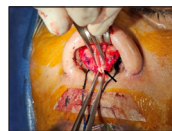
"Open structured rhinoplasty using PCL mesh as septal extension graft and then covered with septal and conchal cartilages" Samsung Galaxy S23 Ultra By Eduardo C. Yap, MD