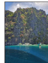
"The Slate of the Twin Lakes" Samsung Galaxy S23