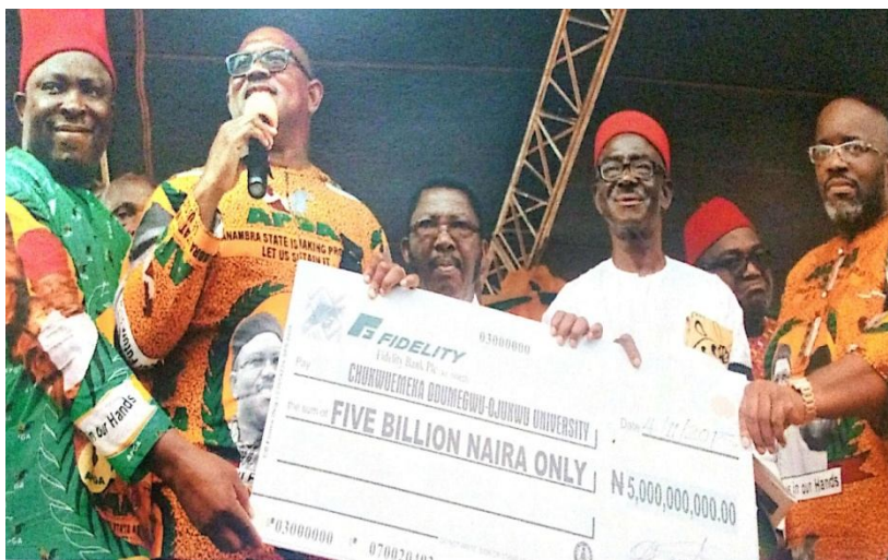
Gov. Obi presenting a cheque of N5 billion for continued provision of infrastructure to Chukwuemeka Odumegwu-Ojukwu University.

Similarly, extensive government expenditure on the State College of Education in Nsugbe and the College of Agriculture in Mgbakwu resulted in the provision of more than 40 new buildings for the three tertiary institutions put together.