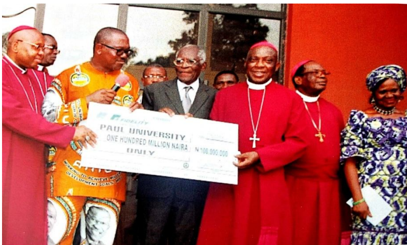
Peter Obi presenting a cheque of N100,000,000 to Paul University, Awka.