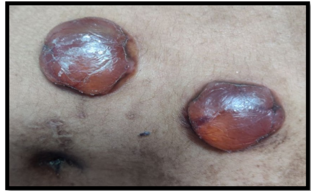
Figure 1. Thinned out parchment like epidermis with CSF bullae

Upon presentation, the two abdominal swellings or CSF bullae were measured to be 4cm by 3 cm, soft, non-reducible, and brilliantly transilluminated, with a parchment-like thinned-out layer of epidermis covering them. (Figure 1 & 2) Deep palpation revealed no underlying collection.