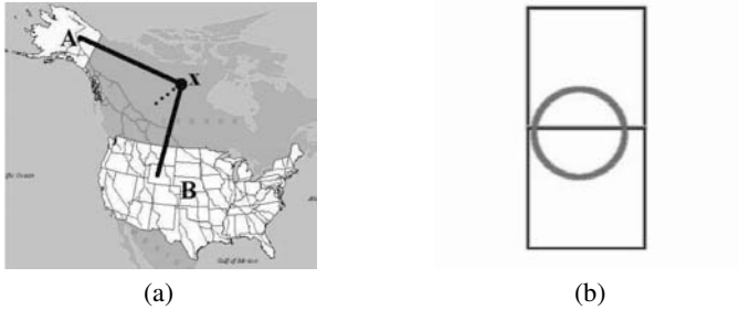
Figure 2: (a) x is diagonally above A and diagonally above B , but not diagonally above A \cup B . (b) The circle is in the squares but not in a square.