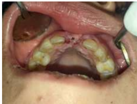
Figure 1: Diffuse swelling in maxillary labial vestibular area was visible extending from left lateral incisor to right lateral incisor region

Computerised tomography of the maxilla revealed well defined, radiodense lesion representing impacted teeth with morphologically altered teeth wrt 11, 21 region. Well defined radiodensity similar to that of enamel, dentin and pulp arranged haphazardly simulating that of a malformed tooth structure in its greatest dimension. Lesion in maxillary anterior region was of size mesiolaterally 19.2 mm, antero posteriorly of 11.4 mm with altered tooth structure in it. The lesion was bordered with well-defined radiolucent margin. No nasal breach on right side but close approximation of impacted tooth to nasal floor of right side. Thinning of buccal and palatal cortical plates was observed wrt impacted 21 having altered morphology. Distally placed morphologically altered 11 was with close approximation with nasal floor (Figure 2). Provisional diagnosis of dentigerous cyst associated with malformed incisors was given.