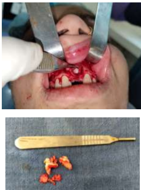
Figure 4: Grossed specimen

The H and E stained soft tissue section revealed the presence of non-keratinized stratified squamous epithelial lining resembling reduced enamel epithelium and connective tissue wall surrounding the cystic lumen. The cystic lining was 2-3 cell layer in thickness without any rete ridge formation. The connective tissue wall was composed of plump fibroblasts, delicate collagen fiber bundles, blood vessels along with areas of extravasated RBC's. Presence of moderate amount of chronic inflammatory cell infiltrate was observed (Figure 5). The H and E stained decalcified section of tooth revealed the presence of tooth like structure composed of dentin, a thin layer of cementum along with pulp tissue (Figure 6). Overall features were suggestive of dentigerous cyst associated with impacted and malformed incisors.