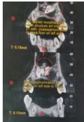
Figure 2: Well defined radio density simulating that of a malformed tooth structure in its greatest dimension

Patient was operated under local anesthesia. To avoid excessive bone loss, teeth were partially exposed and removed with surrounding soft tissue (Figure 3). The enucleated specimen contained 2 malformed hard tissues (tooth specimen) and bits of soft cystic lining (Figure 4).