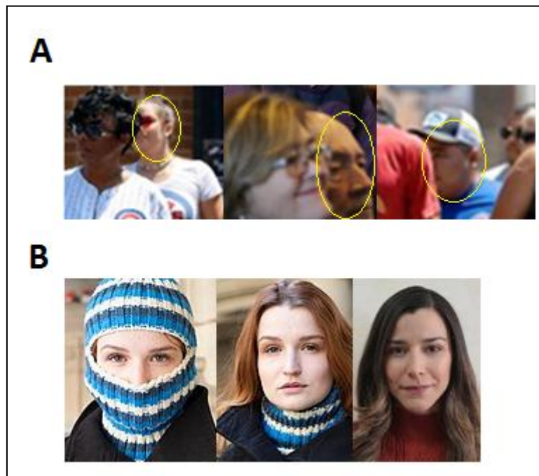
Figure 1. Some Partially Blocked Face Samples.

A. Partially occluded face samples in the LFW database. B. Face samples partially occluded by the AR database.