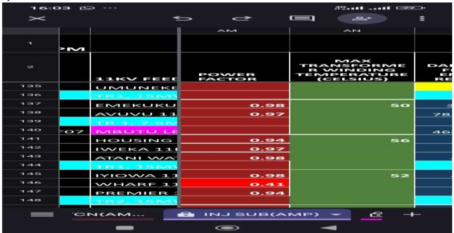
Fig 4; Winding Temperature

Fig 3 showed the insulation test carried out at Atani Injection substation. The graph showed that it is only Iyiowa that failed the insulation test. The test result will guide the operator on duty not carry out operation on Iyiowa feeder. However, it will inform the management of preventive maintenance thereby safe guarding the equipment and the live of the operator on duty. Furthermore, it will reduce operational cost, because explosion incurs more operational cost.