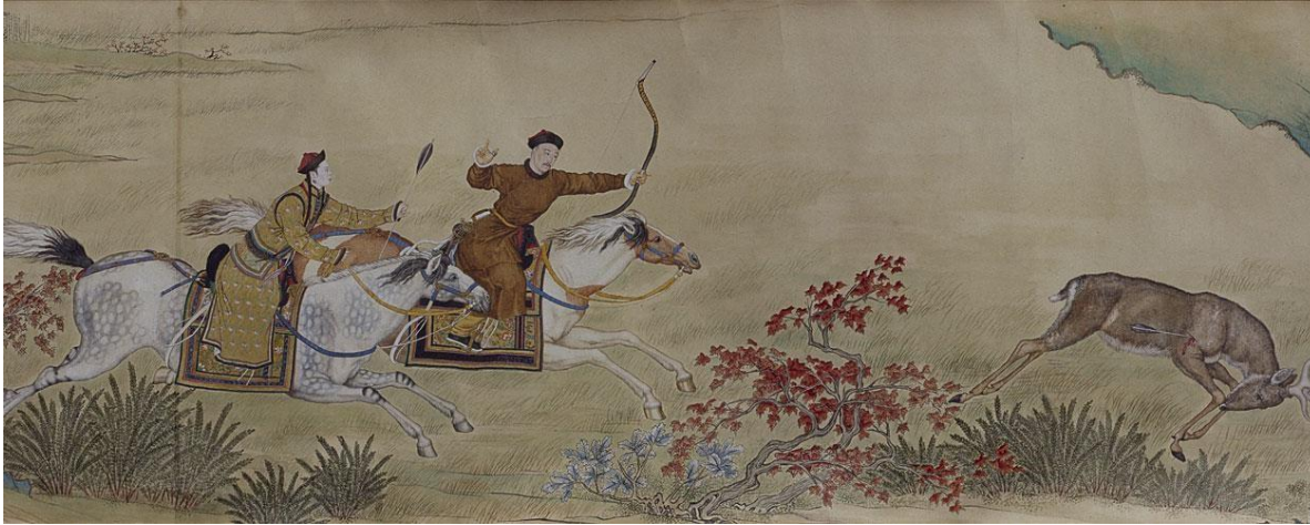
Figure 6. Scroll of Emperor Qianlong and His Concubine Winning a Deer 乾隆帝及妃威弧獲鹿圖卷

beautiful imperial concubine riding close behind and handing over a feathered arrow at a critical moment. By identifying the hairstyle costume and facial features, the imperial concubine in the picture wearing traditional Qing Dynasty armor is considered to be Concubine Rong from Xinjiang. The two portraits of women in armor during the Qianlong period show us not only the Emperor's acceptance of Western armor but also his enlightened attitude toward women in military attire, The rulers of the mid-Qing dynasty were tolerant of Chinese studies, this change was due in part to the Qing Dynasty's admiration for "Harmony" culture during this period. "Assimilation" was a very crucial core of Qing culture.