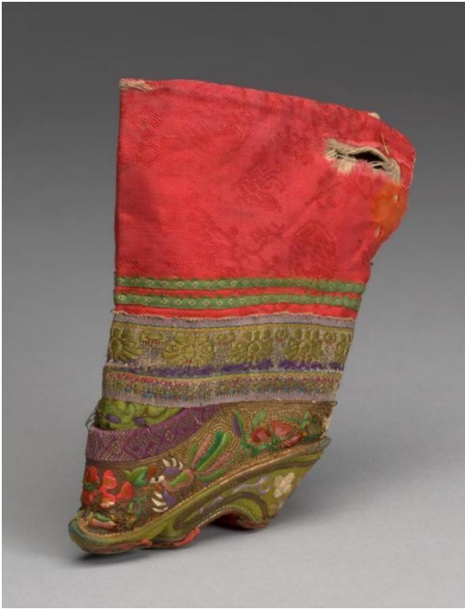
Figure 5. Lotus shoe, Qing dynasty (1644–1911), c. 1860s. Blue and red sateen, gilt trim 13.8 × 11.4 × 4.3 cm (5 1/2 × 4 1/2 × 1 3/4 in.)

Figure 2 demonstrates that the female general in this photograph did not suffer from foot-binding. Her identity is likely to be a Manchu woman, a high-status Manchu woman. In contrast, the Manchu group having never been influenced by Confucian culture is more receptive to women, at least the armored image of women has never been displayed visually in the thousands of years of Han culture. The emergence of this landscape is related to the multiple cultural order of the game in the early Qing Dynasty. In the early Qing Dynasty, the Cheng-Chu school (程朱理學) originating from the Song Dynasty had an important position, in its later stages of development the "Zhu Zi school", which overemphasized ethics and morality and the order of inferiority and superiority, was gradually rejected by the mainstream cultural circle. The moment in history women's wearing of male armor may be interpreted as a protest by the intercultural rulers against the decaying views contained in Cheng-Chu's philosophy.