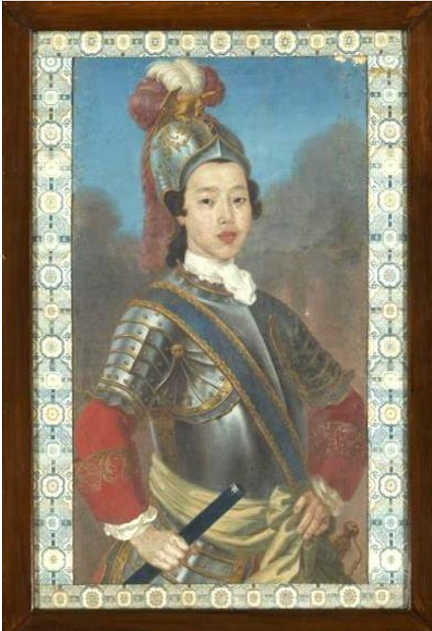
Figure 1. Oil portrait of woman in armor. The Qing Dynasty

honourable. In some historical research is assumed her to be the Qianlong Emperor's concubine Rong. The Draft History of Qing (清史稿) (Zhao, 1985) records that Princess Rong was the only concubine of the Qianlong emperor from the Uyghur tribe, adept at riding and archery, and often accompanied him on his hunting trips; Another hypothesis holds that was the youngest daughter of the Qianlong emperor, Princess He Xiao. In any case, we are concerned that the armored figures of Chinese women from the Qing Dynasty have generally been ignored or marginalized, and it is this unidentifiable art painting from over 200 years ago that reminds us that they truly existed.