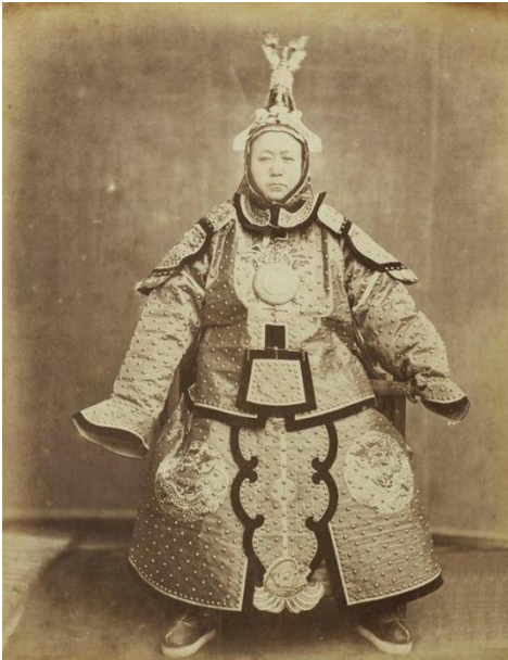
Figure 2. Women in Qing Dynasty Armor

Guifei wore armor during the Chenghua period of the Ming Dynasty (1465-1487): "The emperor every parade, Wan Guifei wears armor accompanied by horseback riding." 「帝每遊幸，妃戎服前驅。」 (Wang, Wan, & Zhang, 1959) But these were only recorded in historical literature, the visual image of female armor in China's feudal dynasties would have begun in the Qing Dynasty.