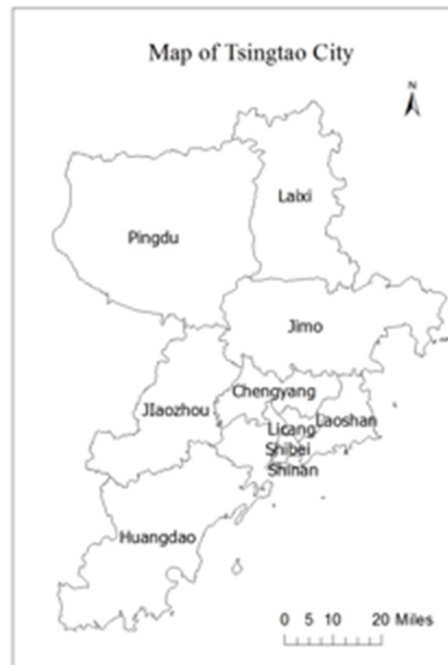
Figure 1. Map of Tsingtao City