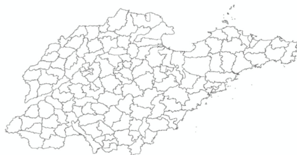
Figure 1. Map of Shandong province