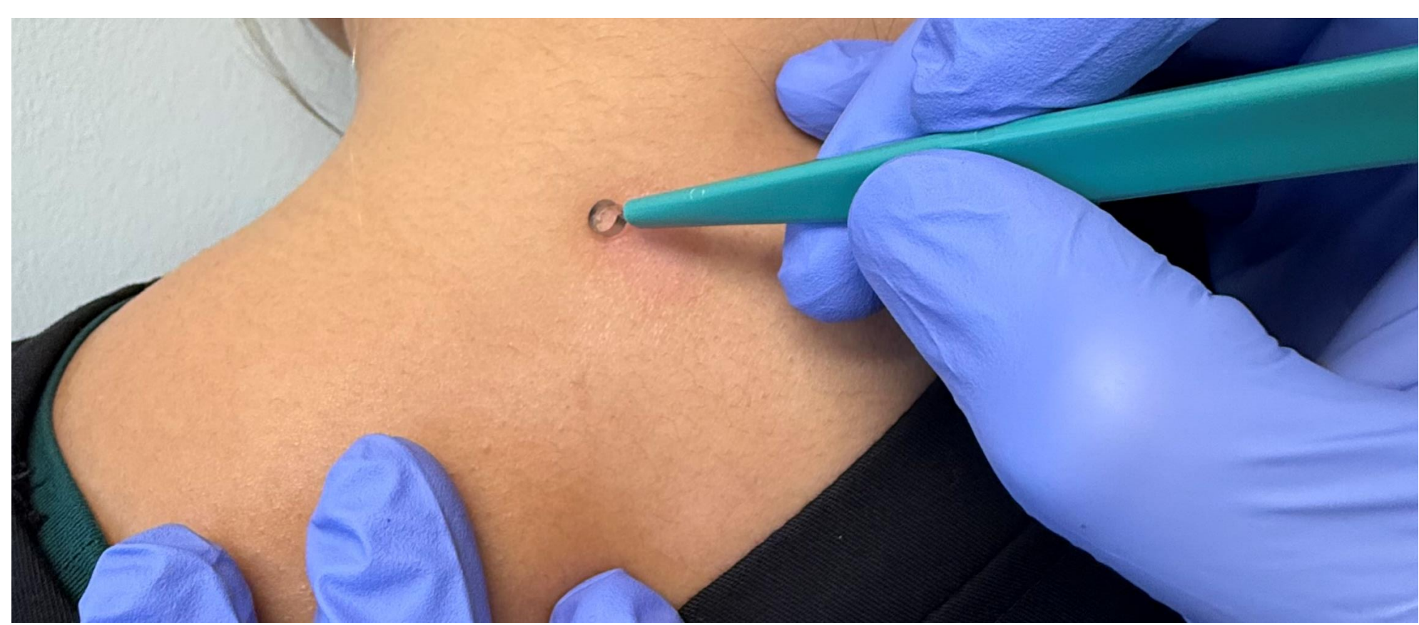
Figure 1. Non-invasive skin sampling technique

After preparation of lesion to be sampled with an alcohol swab, gently scrape the lesion with the blunt end of a curette ten times followed by a quality check to ensure the sample was collected and sample storage in RNA preserving buffer without requirement for freezing