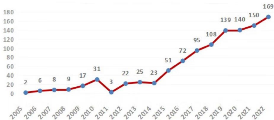
Figure 1. the trend of the number of research papers observed by teachers

In recent years, there are many researches on teacher observation at home and abroad. In CNKI, Wanfang database, VIP and Duxiu knowledge base, key words of "teacher observation" were typed, and nearly 130000 records were displayed. Type in the keyword "observation ability of preschool teachers", and display nearly 12000 records. Among them, there are few works about the observation ability of preschool teachers. After consulting the titles of the records, it is found that the journal articles are mostly about observation problems and strategies, while the master's thesis is an empirical study and case study on the improvement of preschool teachers' observation ability in a certain region or an urban area. There are 5 Chinese core journals and 17 master's theses about the influence factors of preschool teachers' observation ability which are found on the Journal online. Among them, there is little research on the observation ability of preschool teachers in Tibet. Figure 1 shows the change trend of the number of research papers on preschool teachers' observation ability from 2009 to May 2022.