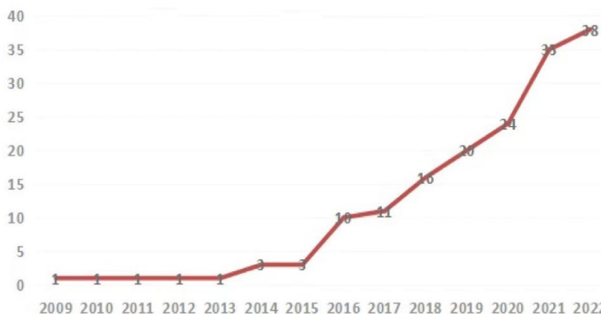
Figure 2. the trend of the number of research papers on preschool teachers' observation ability

the number of published papers increased fastest, and showed a trend of gradual increase, which attracted the general attention of the education sector.