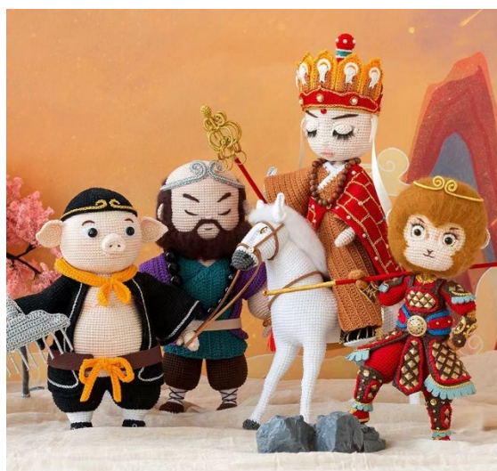
Figure 5. Three-dimensional doll crocheting works

The texture of crocheting dolls can not be replaced by machines. The complex stitches of short needles, long needles and long needles give crocheting the characteristics of many changes. Applied to crocheting, its texture change is one of its major characteristics, bringing more texture expression. Crocheted dolls are characterized by strong three-dimensional sense (Figure 5 Figure 6). In creating a character, it is usually expressed with a variety of colored lines. In terms of technical requirements, it is necessary for producers to have a strong ability to change lines and hide lines, and integrate as a whole. The second is the choice of padded cotton. At present, the choice of padded cotton on the market is mostly high-elastic PP cotton, which has greater elasticity and is more comfortable to touch when used in dolls.