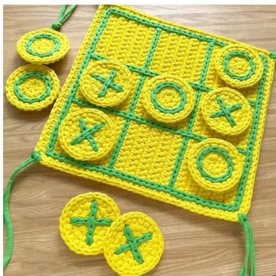
Figure 7. Hook knitting early education books

Third: the use method can be adjusted according to the baby's cognitive ability, which fully provides the space for the baby to actively perceive and explore.