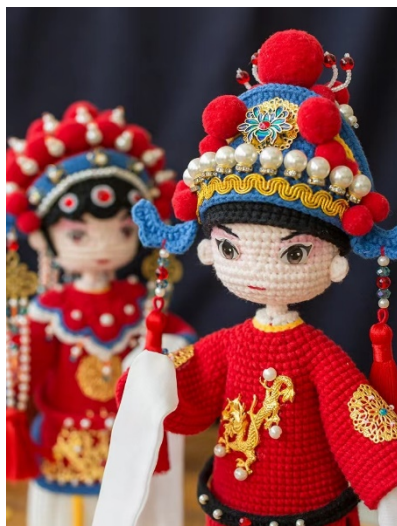
Figure 6. Three-dimensional doll crocheting works

Crocheting dolls also require the most packages of materials, and most of the dolls' eyes can be customized. Crocheting is a challenge, but there are ways to do it. To hook a doll, crochet from the feet, then merge the two and hook all the way to the top. In this process, accessories such as arms can be pinched and stitched in advance, then added in the process of loop hook, and hooked together to the main body with a short needle, which not only saves the work of stitching, but also avoids suture marks and makes the connection more firm.