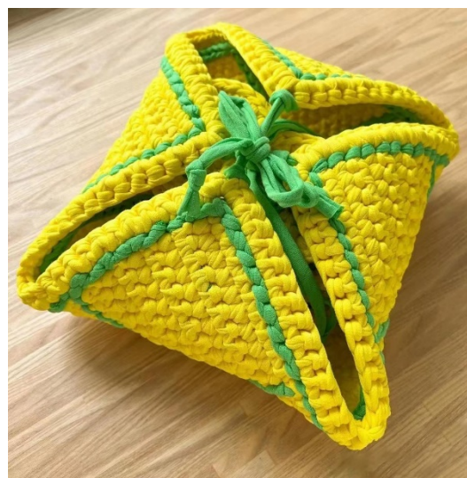
Figure 8. Hook knitting early education books