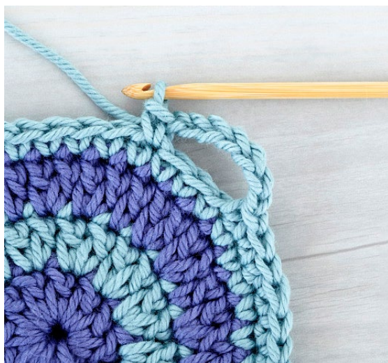
Figure 1. Crocheting texture picture

In terms of crocheting properties, hand-crocheted fabrics are woven by different crochet methods, such as short needle, long needle, reduced needle, short needle plus needle, through the delicate processing of the knitter to form finished products with different rhythmic textures (as shown in Figure 1). At the same time, the color is also very variable, which can be combined with adjacent colors, complementary colors and conflicting colors to create both minimalist and colorful works (as shown in Figure 2). Secondly, crocheting works are hooked by different thread products, which can be fuzzy toys, delicate micro-hook ornaments, or combined with other materials, such as sequins and feathers, to make home decorations and decorative paintings. All these make it possible to combine crocheted works with cultural and creative surroundings.