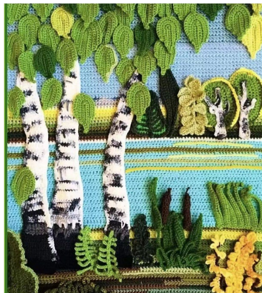
Figure 4. Crocheted decorative painting

Crocheting has different effects due to different weaving materials. The texture of nylon yarn, milk cotton, Chenille and other wool are very different, so that according to the content of the picture, the right material can be selected to present different effects. Beginners in the first time to learn, polyester fiber, Persian fiber can choose. For crocheting decorative paintings, the choice of wool thickness will also show a great difference to the work. Fine creation, the best wool control in the range of 2mm. The thicker the wool texture feeling will be heavier, in the fineness, the finer wool will be worse.