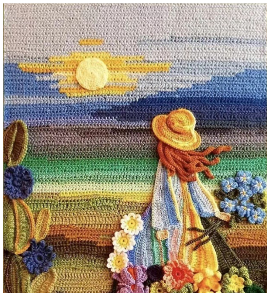
Figure 3. Crocheted decorative painting