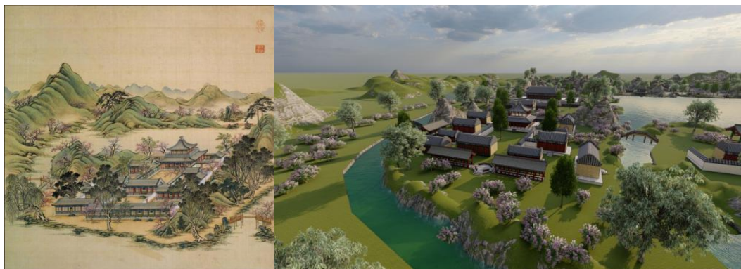
Fig. 10 The whole picture of Rugu Hanjin in the 40 scenes