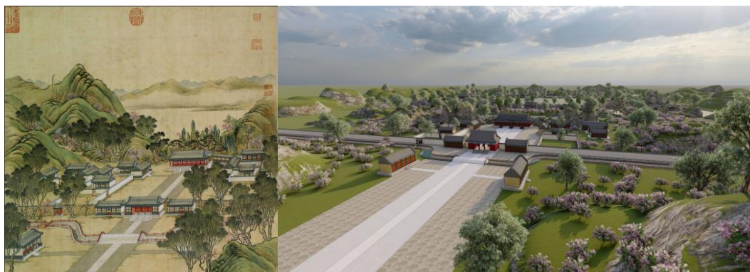
Fig. 1 The whole picture of Zhengda Guangming scenic spot in the 40 scenes

Zhengda Guangming scenic spot is the first of the 40 scenes, for the main hall of the Old Summer Palace, is the emperor of the Qing Dynasty in the Old Summer Palace. It was also because of its grandeur, it was taken as a temporary command by the British and French allied forces, and burned down after their retreat. Now the entrance of the Zhengda Guangming Palace has been changed to rice fields, the temple is marked with the position, the north only shoushan and left, jade bamboo shoots also disappeared.