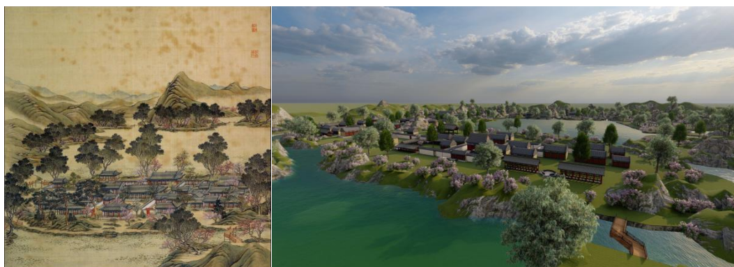
Fig. 2 The whole picture of Jiuzhou Qingyan in the 40 scenes

Here is a presentation of our digital recovery: