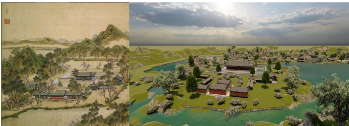
Fig. 9 The whole picture of Tantan Dangdang in the 40 scenes

Our recovery modeling diagram is as follows: