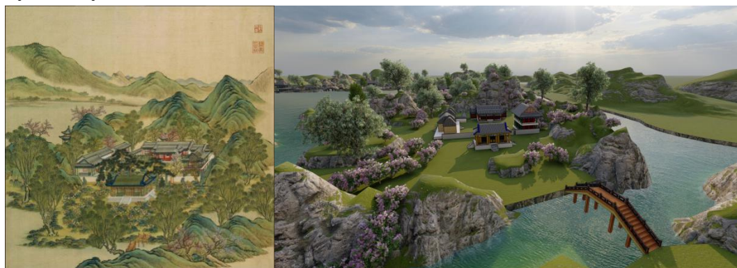
Fig. 3 The whole picture of Louyue Kaiyun in the 40 scenes

"Louyue Kaiyun" was built in the southeast corner of the lake scenic area, formerly known as the peony pavilion, symbolizing peace and prosperity, lounge, library and viewing platform here, famous for flowers, Kangxi 61 years, Kangxi, Yongzheng and Qianlong once grandparents three generations