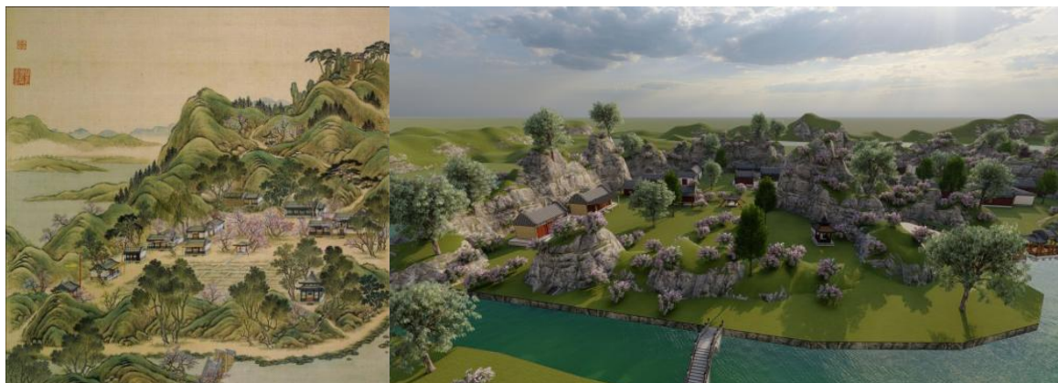
Fig. 8 The whole picture of Apricot Flower Spring Pavilion in the 40 scenes