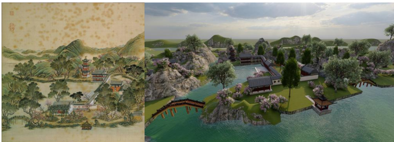
Fig. 6 The whole picture of Ciyun Puhu in the 40 scenes