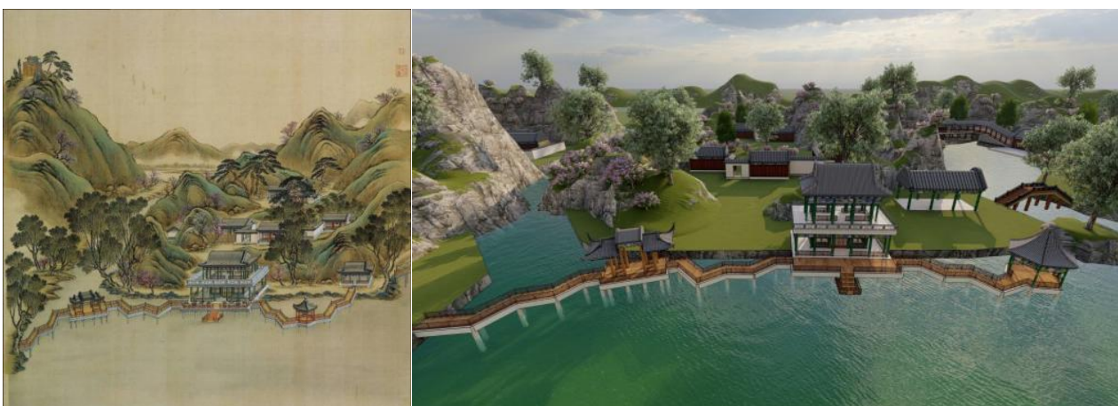
Fig. 7 The whole picture of Upper and lower sky light in the 40 scenes