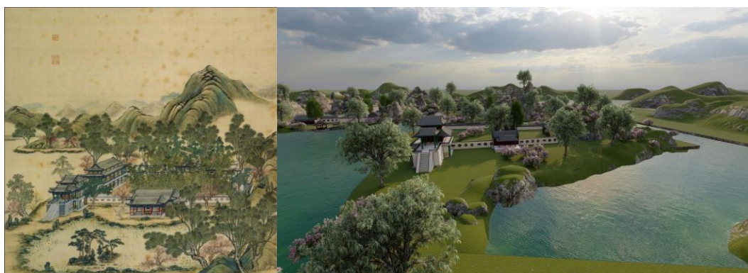
Fig. 4 The whole picture of Natural drawing in the 40 scenes