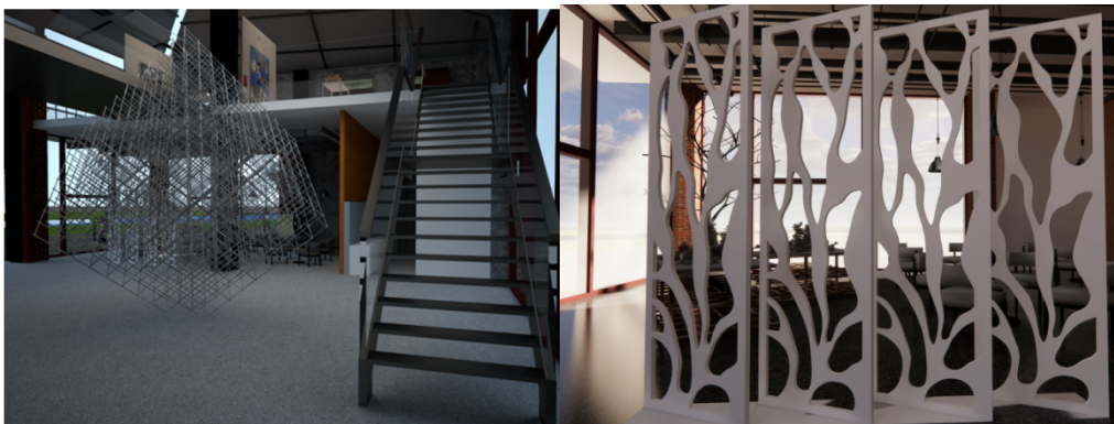
Fig. 3 Renderings of the "Island Song" exhibition hall (Photo credit: Self-drawing)

The interior is divided into two parts, and the building is divided into four areas with rest areas. Ornamental area, toilet, and art large display, the second floor is divided into two parts to corridor to form a hollow out style, can be from top to bottom ornamental light change effect and art appreciation, the design combines the basic elements of flat packaging factory red brick steel wood materials to create, mainly expressed an original site is to retain some elements and on its basis to retain its original historical legacy also on the basis of an innovation, in the transformation of the old factory while we need to show our design principles, let the public can very good accept. In the pursuit of beauty on the road, everyone has their own ideas, we accept a different aesthetic, but we must seek common ground in different ways, so that our old factory renovation design can be accepted by the broad masses.