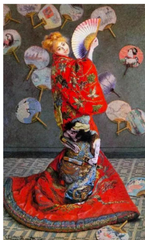
Figure 6. Camille Monet in Japanese Costume