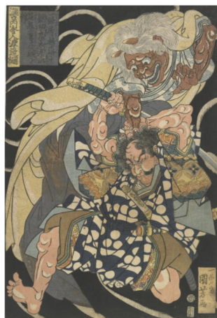
Figure 4. Imperial Bodyguard Watanabe no Tsuna