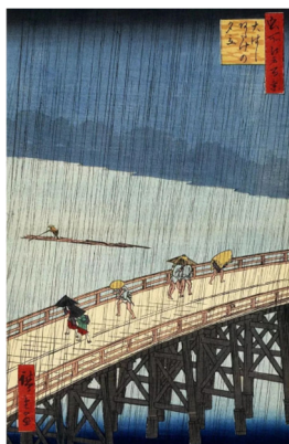
Figure 5. One Hundred Famous Views of Edo

Utagawa Hiroshige (1797-1858) was a great Ukiyo-E painter. He is good at using beautiful brush strokes and harmonious colors to express the quiet atmosphere of nature, freehand and lyrical are his characteristics. The natural scenes depicted by him are always closely related to the characters and full of poetic charm. Among them, Tokaido Fifty-three Times (Figure 5) is the most famous and one of the most representative works. Through the extraction and introduction of western classical painting elements and Oriental unique has been combined to render the landscape atmosphere.