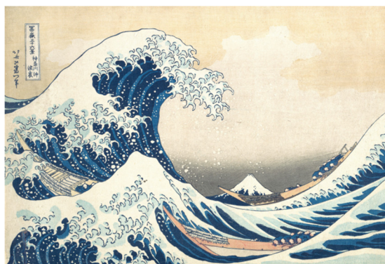
Figure 3. Thirty- Six Views of Mount Fuji-The Great Wave Off Kanagawa

By the middle of the 18th century, Bijin-ga and Yakusha-e gradually declined, and Ukiyo-e developed into the late period. In 1853, with the outbreak of the Black Ship incident, Japan was forced to open its door to trade with Europe. Naturally, there were also exchanges and collisions in cultural exchanges, which promoted the birth of Ukiyo-e landscape painting. Among them, the most famous painting Thirty- Six Views of Mount Fuji-The Great Wave Off Kanagawa (Figure 3) is not only the best Ukiyo-E painting, but also the representative work of Japan in the long history of world art.