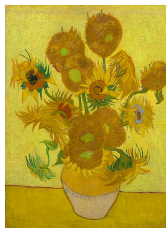
Figure 9. Sunflowers