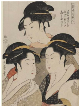
Figure 1. Toji san bijin (Three Beauties of the Present Day)

customs of the market, came into being. At the beginning of its development, Ukiyo-e works were mainly divided into two categories, namely "bijin-ga" (Figure 1) and "yakusha-e" (Figure 2) (theatrical performers engaged in kabuki performances). Later, works depicting natural scenery, flowers, birds and animals, and historical stories gradually emerged. Unlike Yamato paintings, these paintings reflect the daily lives of ordinary citizens rather than the imperial aristocracy.