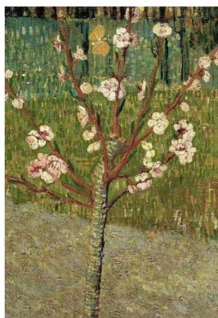
Figure 8. Almond Tree in Blossom