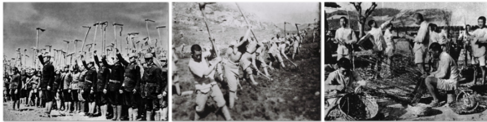
Figure 3. Old photos of Nanniwan

science and technology themes, photos and related news materials can be used as backup. Huawei, as a typical example for me to express the significance of Nanniwan spirit, its spirit of self-reliance and hard struggle strongly reflects the determination of the Chinese nation "Our country should become stronger", and "Our country should become stronger" is also the main text of the author's poster design.