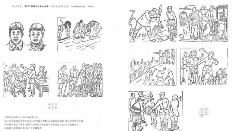
Figure 4. Yan 'an woodcut showing the Theme of Nanniwan Source: Yan 'an Literature and Art Archive Cartoon [11]