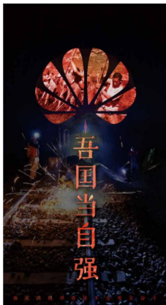
Figure 9. Author's Design (b)

bright contrast, huawei Logo, is the warm orange tinted piece in the upper right corner shows the five-star red flag of Venus, concrete is appropriation of collage of Nanniwan raising farm implements the military and civilian reconstruction "mud bay" landscape scene photos, with ordinary little heroism on ancient and modern, Behind them is a small city steel skeleton and a large area of bright sky, giving people hope, optimism, enterprising spirit.