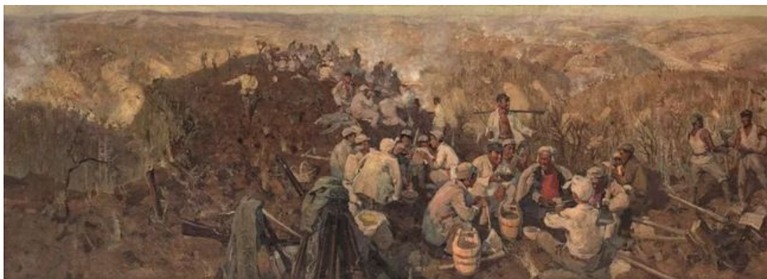
Figure 6. Jin Zhilin's oil painting Nanniwan