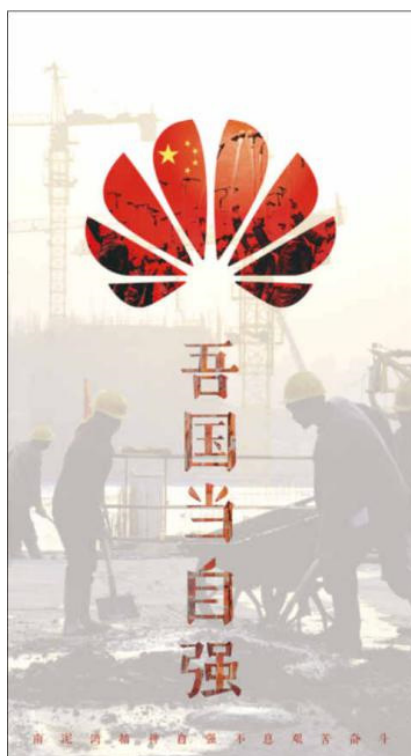
Figure 8. Author's Design (a)

The main part of the screen is the silhouette of the Huawei Logo. Its silhouette can be associated with fireworks, flowers, lanterns, chopped apples and so on. The following is "our country should self-improvement" vertical version of the main text, giving a sense of stability. I designed each version of the font separately, and at the bottom there was a horizontal version of the small words "self-reliance, hard work". "Graphics and text have their own wonderful, read the delicacy of text in graphics, understand the original meaning of graphics and information. Read the verve of the graph in the text, feel the broad walk in the space and real. [18] " The main text and pictures in posters promote each other. In addition, the overall use of color, play the role of association "color association is based on people's experience, memory or knowledge of the past. The text, image and color work together to construct the spirit of Nanniwan. After a series of attempts, I chose the composition technique of "isomorphism" to determine the effect of Huawei Logo. "Composition refers to the arrangement and definition of elements and features in an area. This arrangement is both pleasing to the eye and, more importantly, intended to convey a specific message and meaning." [19]