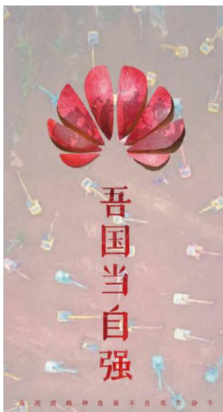
Figure 11. Author's Design (d)

The fourth Huawei Logo can also be replaced with a cut apple (bottom right of Figure 11). Huawei and Apple are both mobile phone brand leaders, this creative humor to convey foreign people's support for Huawei brand. On the "apple" is the silhouette of the Nanniwan people, wielding hoes, fighting against heaven and earth. The background picture shows the construction site of Huoshenshan and Leishenshan in Wuhan during the COVID-19 pandemic. Netizens act as "cloud