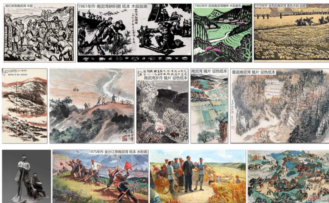
Figure 5. Other Artists Nanniwan's spiritual theme of art creation