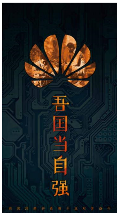
Figure 10. Author's Design (c)