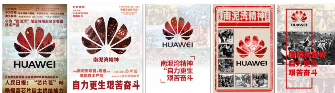
Figure 7. Unused design source: Designed by the author