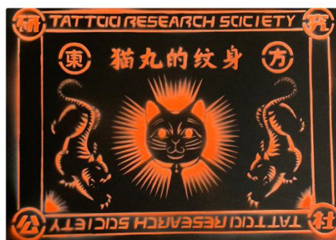
Figure 3. The effect of a single abrupt structure