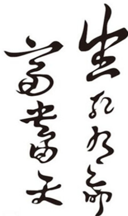
Figure 1. The use of text as a tattoo design

wishes, and in Yue Fei's time the act of tattooing was socially acceptable, reflecting the design and application of writing in the act of tattooing. Talking of modern times, the use of text as a tattoo design, as shown in Figure 1, also influenced the foreign football star David Beckham - 'Life and death have a destiny, wealth and prosperity are in the hands of God'. One of the features of text tattoos that distinguishes them from graphic tattoos is the clear message they convey.