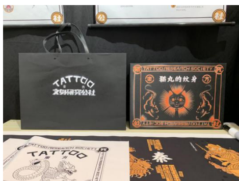
Figure 2. The 'tattoo research commune'