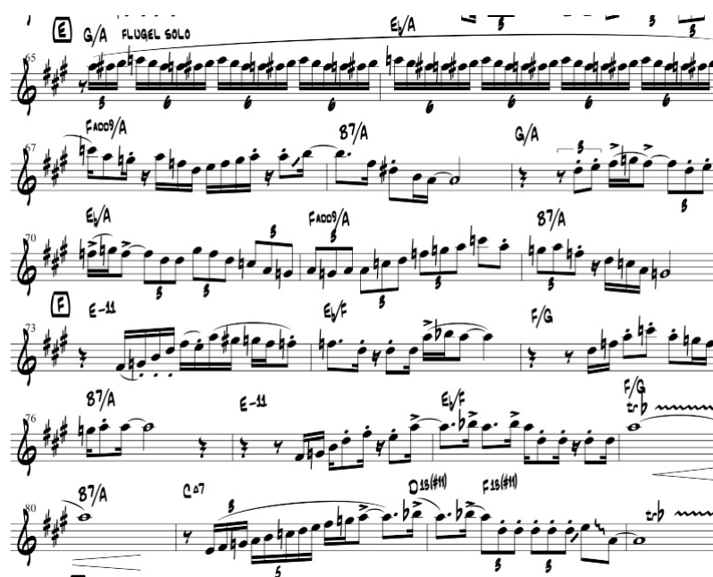
Fig 8. Example 8: (trumpet solo)

Third, the sound of brass is slower than that of woodwind and string; and its sound head sounds heavier, such as the sound of a trumpet. Therefore, it is often necessary to adjust the “attack value” of the brass tone to change its speed according to the speed of different parts. The lower the “attack value” is, the faster the speed is. It is not advisable to make excessive adjustments to the brass tone in order to avoid excessive changes in its sound quality. For example, when the trumpet enters the solo part in Mr. Toad’s Wild Ride, there are continuous six consecutive tones. In this case, it is necessary to reduce the “attack value” of the trumpet tone to make it sound faster to make the sound head more prominent and clearer.