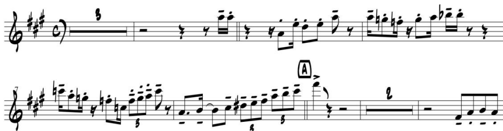
Fig 1. Example 1: (Excerpt from Trumpet Voice)