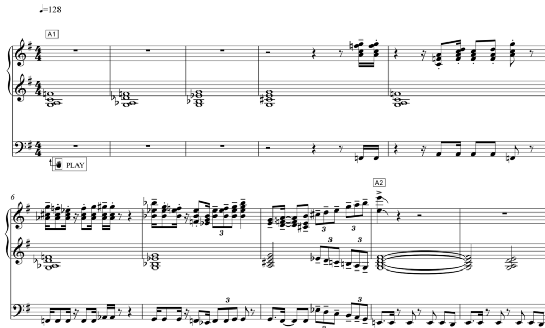
Fig 4. Example 4: (Excerpt from Electronic Organ Score)