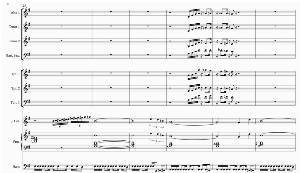
Fig 5. Example 5: (Excerpt from the score)