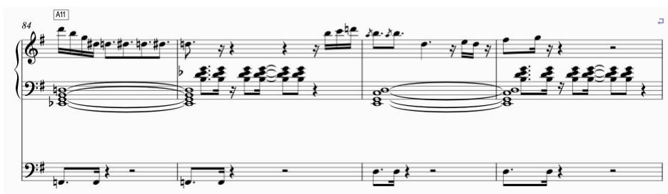
Fig 7. Example 7: (Excerpt from Electronic Organ Score)

There is another way playing electronic organ that is like Lower Memory, that is, Sustain. Since Lower Memory will keep the entire keyboard playing the original sound, the other half of the keyboard cannot perform the melody when the keyboard is split. In this case, sustain is needed. For instance, in the music Mr. Toad's Wild Ride, when the melody part is played with the right hand, both harmony and rhythm enhancement need to be done with the left hand. Therefore, sustain should be selected for adapting this part.