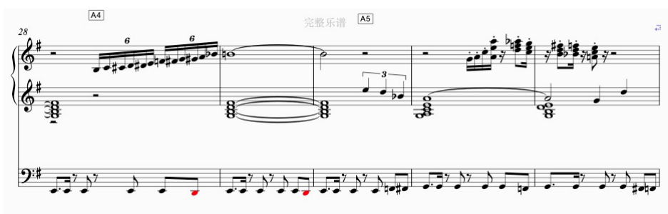
Fig 6. Example 6: (Excerpt from Electronic Organ Score)