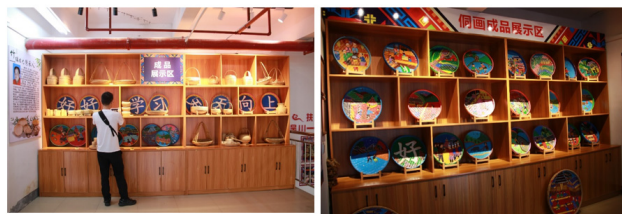
Fig 3. Intermediate product display area of Jiangchuan District Central Employment Base for persons with disabilities, Sanjiang