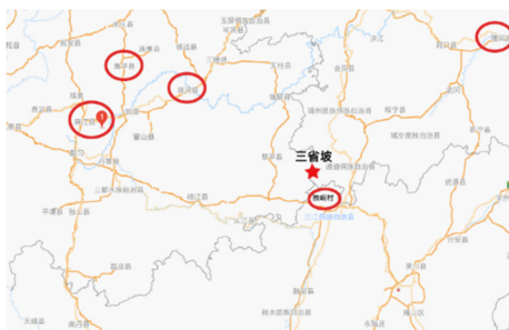
Fig 1. The representative farmers in the three provinces draw the distribution of counties and cities