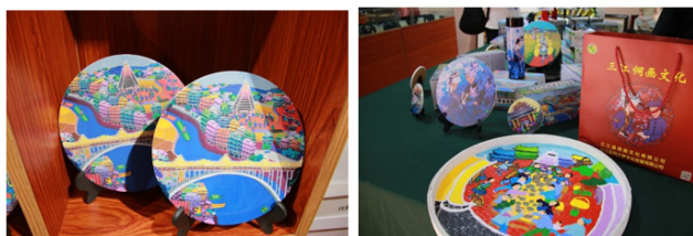
Fig 11. Cultural and creative products of Sanjiang Dong Art Museum