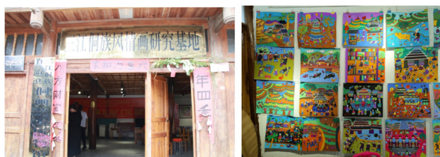
Fig 8. Research base of Dong Nationality's amorous feelings painting in Sanjiang