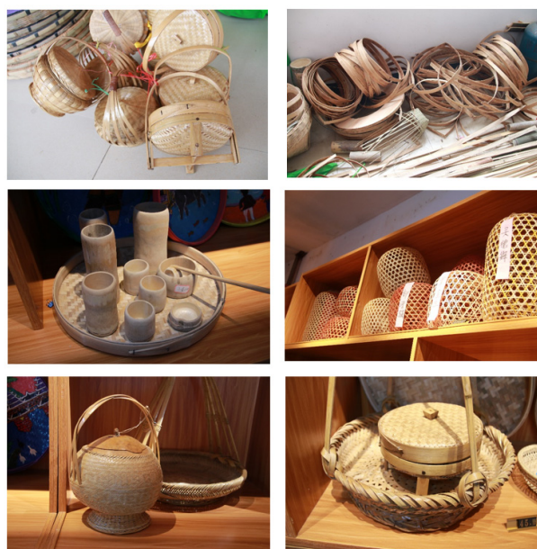
Fig 6. Weaving dustpan painting material and finished bamboo product display

(b)Transmission base drives the mode of transmission of peasant paintings -- “Sanjiang Dong peasant paintings transmission base”in Dudong town: