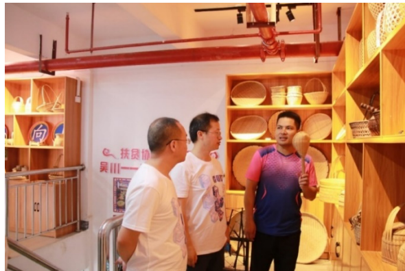
Fig 4. The person in charge of the base introduces the production process of the product