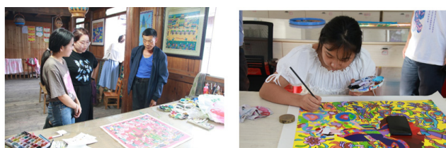
Fig 10. Works created by students

(c) The mode of selling and driving peasants' paintings -- Sanjiang Dong Painting Gallery: The investigation team also visited the Sanjiang Dong Art Museum, which covers an area of more than 300 square meters and is located next to the ginkgo park on Fuxue Road, Guyi Town, Sanjiang, the museum has a product exhibition hall, an experience area, a training and research school area, a creation room, an office and a collection room, with more than 20 artists from the Han, Dong, Miao and Yao Nationalities, among them, there are 8 inheritors of peasant paintings in Tam Giang, more than 10 painters from peasant paintings, and 5 painters from poor families.