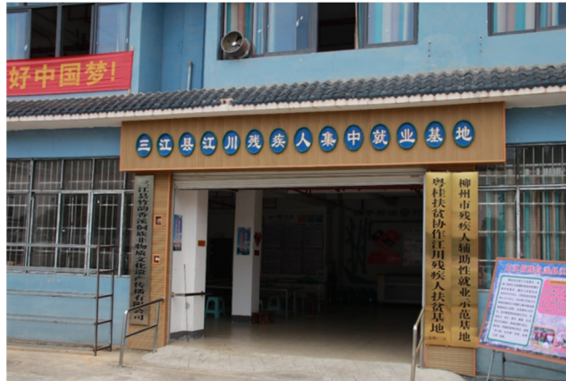
Fig 2. Sanjiang Jiangchuan District employment base for persons with disabilities

bamboo crafts (Figure 6). The person in charge also mentioned that he hopes to cooperate with the university, have the opportunity to let the university's teachers guide him, and also can give the students of the university the practice experience opportunity to draw the dustpan farmer picture to feel the charm of the farmer picture.