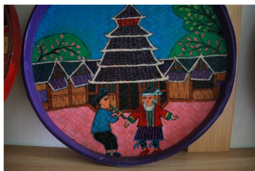
Fig 5. Shows the "Dustpan painting"