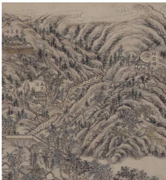
Fig 3. Left: Part of Zhang Ruocheng's Twenty-eight Scenes of Jingyi Garden

the painting of Twenty-eight scenes of Jingyi garden, Zhang Ruocheng outlined the mountain with a brush with less ink, then painted the structure of the mountain in lighter ink [4], and finally painted the color with elegant traditional Chinese painting pigments. This is the method of learning from the painter Wang Meng of the Yuan Dynasty. Why does Zhang Ruocheng learn Wang Meng's painting method? This is because the picture of clouds across the autumn ridge by Zhang Ruocheng, collected in the palace of the Qing Dynasty, contains the words of Emperor Qianlong: he used Wang Meng's method of depicting the mountain structure to express the poetic mood of poet Du Fu, that is "the beautiful autumn scenery makes people forget the troubles of the world."