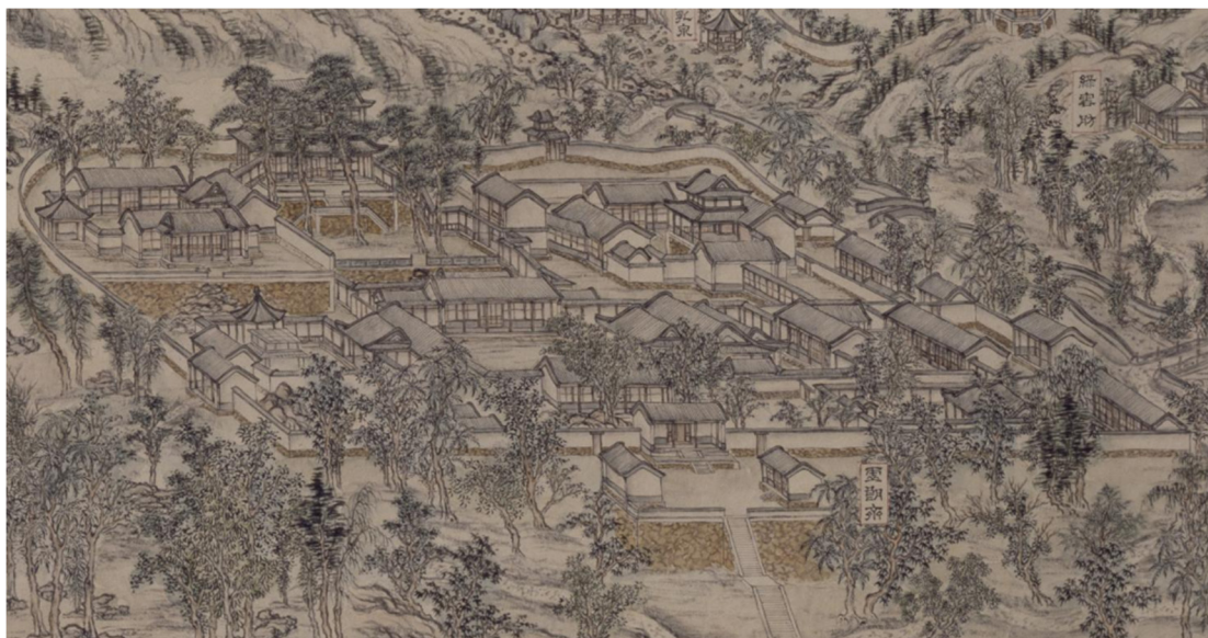
Fig 2. Part of Zhang Ruocheng's "Twenty-eight Scenes of Jingyi Garden"

During the Sui and Tang Dynasties, boundary painting gradually formed an independent painting department. In the Ming Dynasty, the construction of gardens became popular among the people, and garden-themed paintings developed rapidly. In the Kangxi and Qianlong periods of the Qing Dynasty, many imperial gardens were built in the palace, and the painters who worked in the palace specially painted a large number of recording royal garden paintings for the imperial gardens. During the Kangxi period, Tang Dai, Leng Mei and other painters from the Academy of Painting were good at painting rigorous, meticulous and gorgeous landscape paintings. In the Qianlong period, Emperor Qianlong loved calligraphy and painting. He preferred the elegant, simple and fresh painting style of the painters of the Hanlin Academy, rather than the luxurious and rich painting style of the previous court painters. Therefore, the painting style of the royal garden theme at that time was influenced by Emperor Qianlong's preference, and gradually transformed into a simple and fresh style. During this period, in addition to Zhang Ruocheng, there were Dong Bangda, Qian Weicheng, Zhang Ruoai and others among the Hanlin Academy painters who were proficient in landscapes. They all painted a lot of palace garden scenery for the court, and these events are recorded in "Shiqu Baoji" and some other writings.