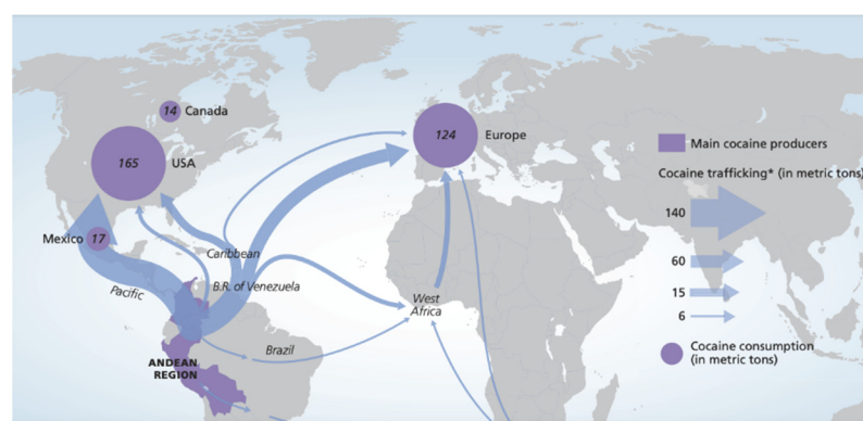
Figure 2. The drug (cocaine) chain in the North and South America/Europe