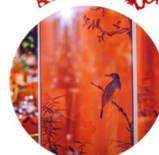
Figure 4. Joyful