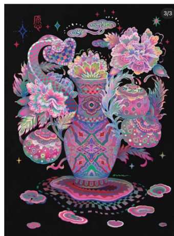
Figure 5. Everything is as it should be