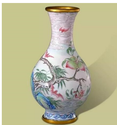
Figure 2. Fortunate Life

In addition, the combination of bat and seawater cliff pattern means "longevity, mountain and blessing"; the combination of bat and spring flowers means "blessing and spring"; the combination of bat and peony means "wealth and good fortune". ". The combination of bats and different auspicious patterns is amazingly varied.