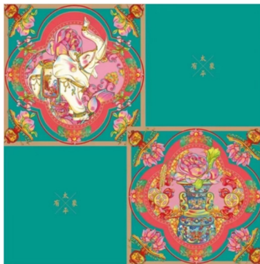
Figure 6. Peaceful with Elephant

roles of the elephant and the vase in the traditional auspicious design in a more dramatic and enriched form, and the bright colors and changes in the composition form also deepen the good moral expressed by the harmonic symbolism to a certain extent. So that the form appears in the fusion of the gods and the gods are elevated in the deformation.