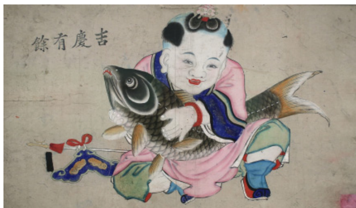
Figure 1. Ji Qing You Yu

the motifs in the pictures and appreciate the good meanings at the same time. In the Yangliuqing woodblock print "Jiqing Youyu", shown in Figure 1, a child is shown holding a carp in his hands, and the size of the fish is almost as large as the child, which means happiness and abundance in life. These works are all part of folk art, using harmonics as a medium to establish a relationship between the visual image and the cultural connotation of the symbol and the symbolized, and to express metaphorically the desire to pray for good fortune and good fortune.