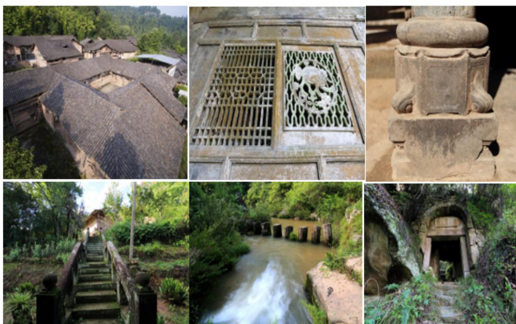
Figure 3. Cultural Relics and Historic Sites of Xuetaangshan Village

Ancestral Hall of Qin (county-level cultural protection unit) was built in the ninth year of Guangxu of the Qing Dynasty. There are a pair of stone lions outside the ancestral hall, which belongs to the typical Zhaomu system. "Sanshan Tongyuan" stone bridge was built in Jiaqing twenty years, because there is a bridge in each of the upper and lower three streams, which was an important transportation hub connecting Shaxi Town and Zhicheng Town at that time. Tombs such as CAI Heng 'an Tomb and CAI Shiyu Tomb in the Daoguang period of the Qing Dynasty and CAI Xingdong Tomb in the Xianfeng period of the Qing Dynasty are tall, magnificent, brightly painted and exquisite stone carvings, which indirectly reflect the life scene at that time. Sanpin Ancient Village built during Jiaqing period of Qing Dynasty was an important military fortress to resist the Bailianjiao rebels. It is surrounded by cliffs and only one road leads to the mountain fastness. Since the Jiaqing period of the Qing Dynasty, many old wells have been built in the village. The water of the wells is warm in winter and cool in summer, which is used for residents' life and production.