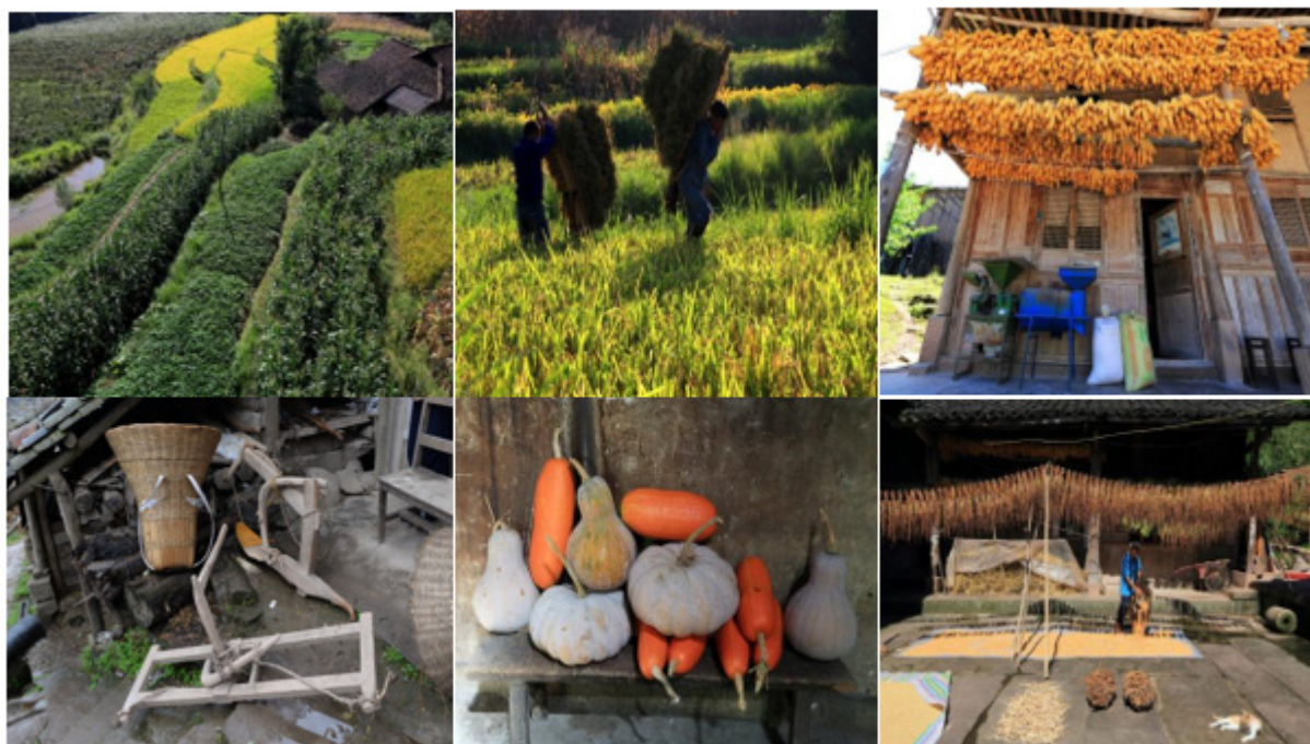
Figure 4. Agricultural Economy of Xuetangshan Village