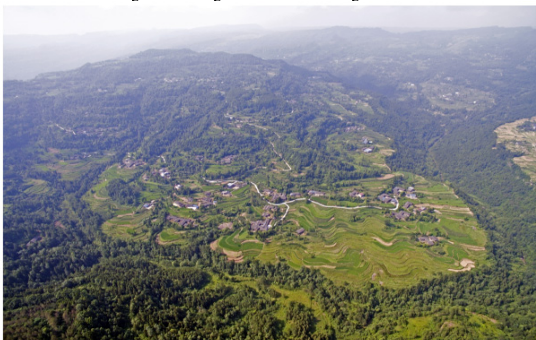
Figure 2. Panoramic View of Xuetaangshan Village

Xuetaangshan Village is located in the Daba Mountain Area, 107°28 '12 "East longitude and 32°4' 27" North latitude. The terrain is mainly mountainous, with an average altitude of 680 meters. It belongs to the subtropical humid monsoon climate, with four distinct seasons, sufficient sunshine, suitable climate and abundant rainfall throughout the year. The village is built around a 2 km long Caijiagou, the upper reaches of the ditch is connected with the Hebagou Reservoir of Tuanyuba Village. The forest resources in the territory are rich, the vegetation is mainly coniferous forest, the forest coverage rate is as high as 61%, there is a hundred years of camphor tree next to the village primary school, ancient trees, many rocks. The village is also rich in animal resources, mainly domestic pigs, cattle, chickens, ducks, etc., there are wild boar, deer, pheasant, wild rabbits in the forest. The location of the village pays attention to the Fengshui pattern, the terrain with high south and low north creates a village face facing north and built along the mountain.