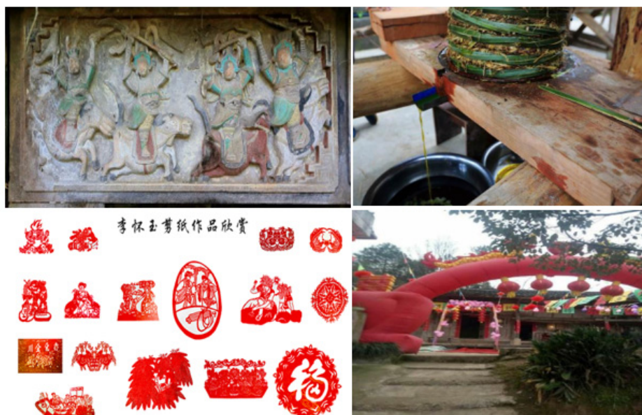
Figure 6. Folk Culture of Xuetaangshan Village