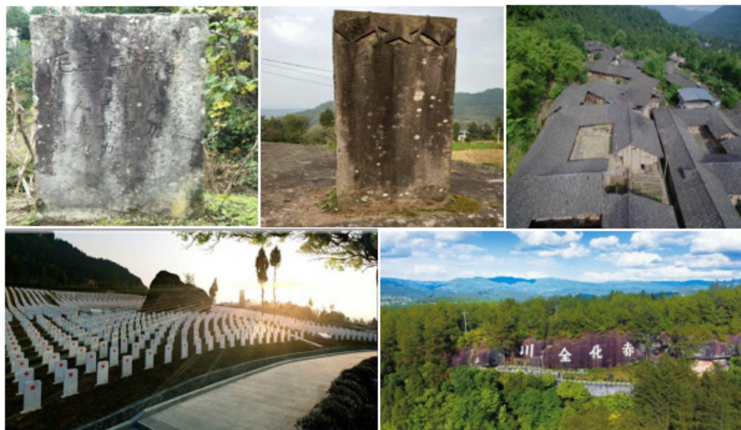
Figure 5. The Red Site of Xuetangshan Village

Located in the red tourist area of Shaxi, Tongjiang County, Xuetangshan village has 21 steles of Chairman Mao's quotations (county-level cultural protection units) with clear handwriting and well-preserved steles, it reflects the social features of villages in the 1960s, and has important historical value and characteristics of the time.