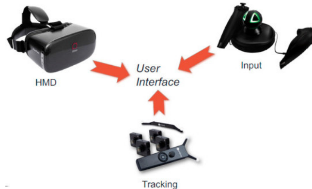
Figure 2. Research on Computer Virtual User Equipment

background image of the graphic design plane, so as to realize the plane background graphic design based on the artificial intelligence algorithm. User equipment is shown in Figure 2.